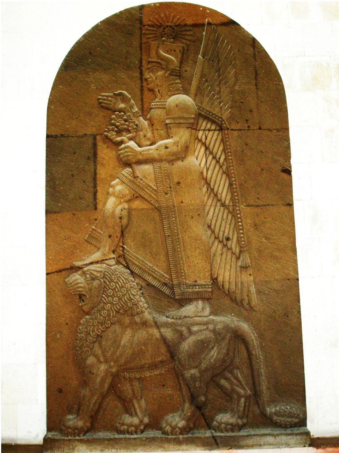
Possible depiction of the Urartian god Haldi, standing on a lion. Erebuni Fortress Museum: Yerevan, Armenia.