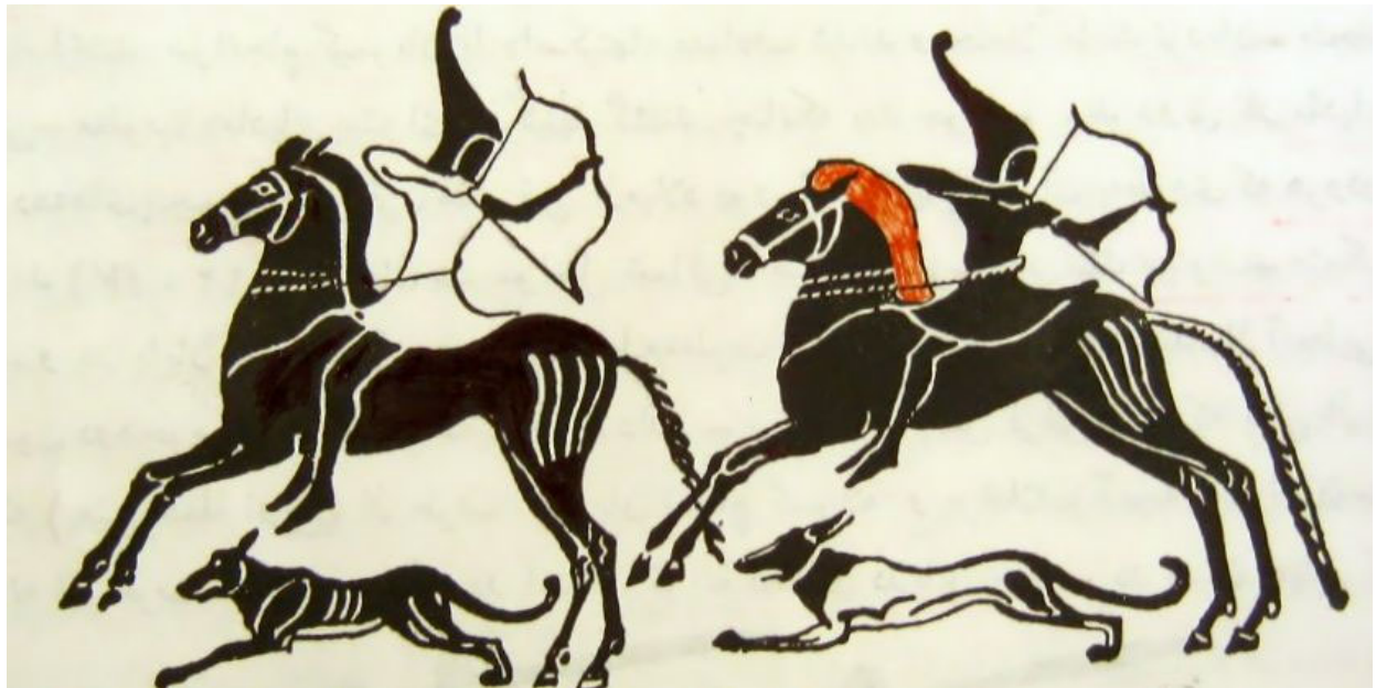
Reproduction of a depiction of Cimmerian mounted archers from a Greek vase. By Shams bahari -

ISBN 964-445-106-6 تاریخ ماد, CC BY-SA 3.0,