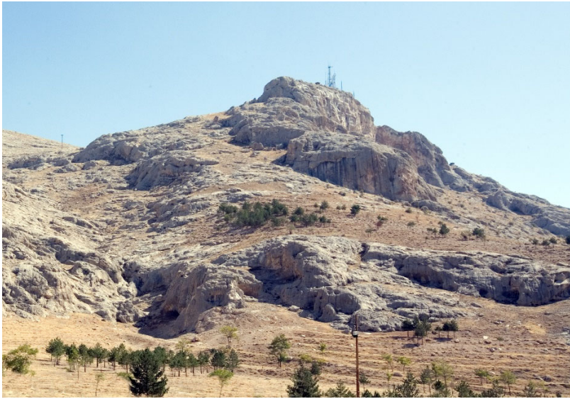
The fortress-city of Rusahinili, "City of Rusa" (modern Toprakkale, Turkiye), built in the reign of King Rusa I of Urartu.