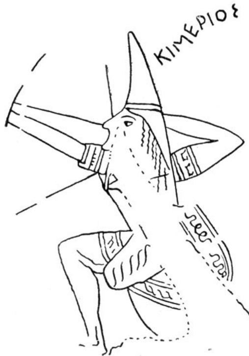
Reproduction of a depiction of a Cimmerian archer from a Greek vase. By User1712 - Own work, CC BY-SA 4.0, https://commons.wikimedia.org/w/index.php?curid=85465543