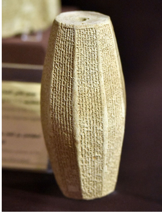
Terracotta cylinder from Dur-Sharrukin narrating Sargon's campaigns.