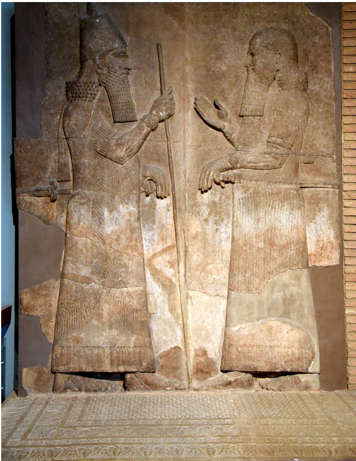
Relief from Dur-Sharrukin depicting Sargon (left) and his son Sennacherib (right), then the Crown prince.