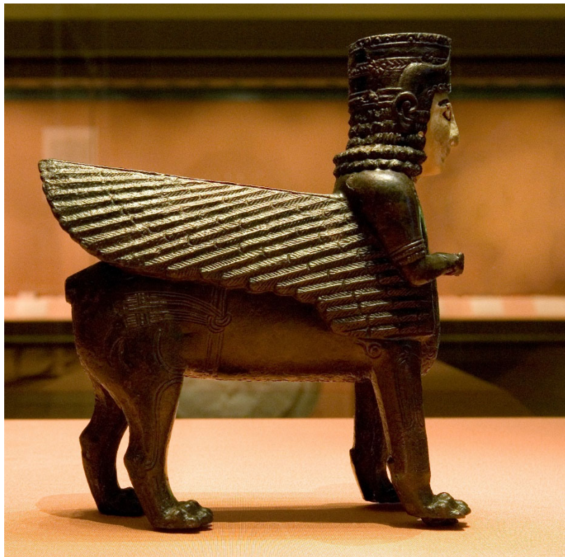
Uartian winged deity, bronze, recovered from Rusahinili (Toprakkale), on display at the Hermitage Museum, Saint Petersburg.