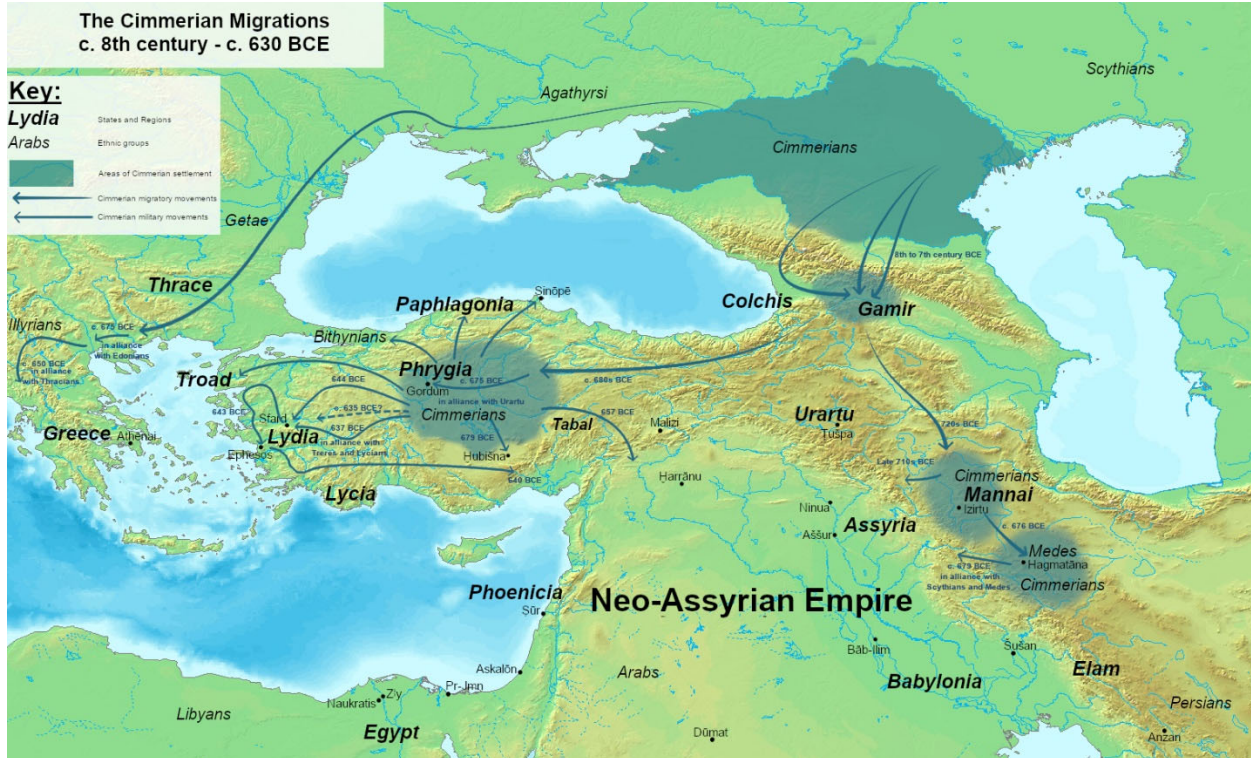
The Cimmerian migrations across West Asia.