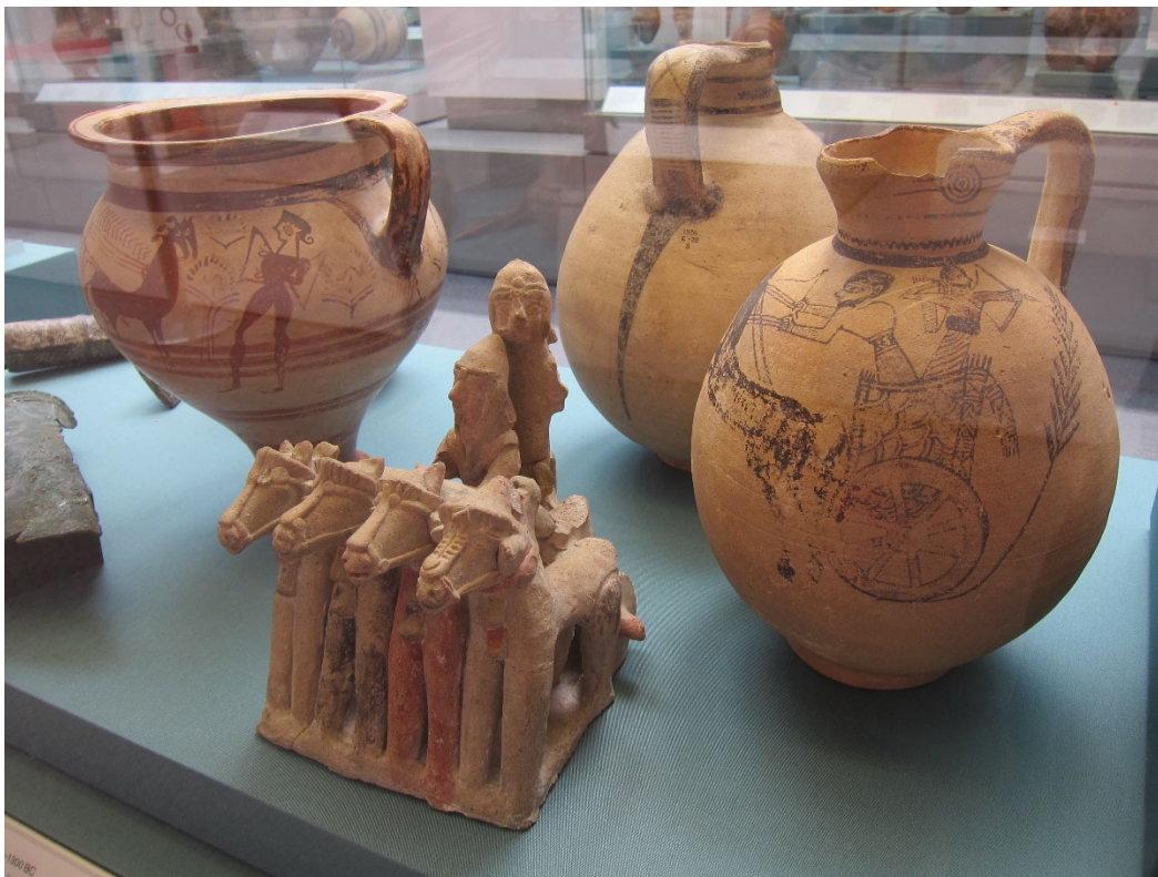
Cypriot jugs and figurines, 800–600 BC, British Museum.