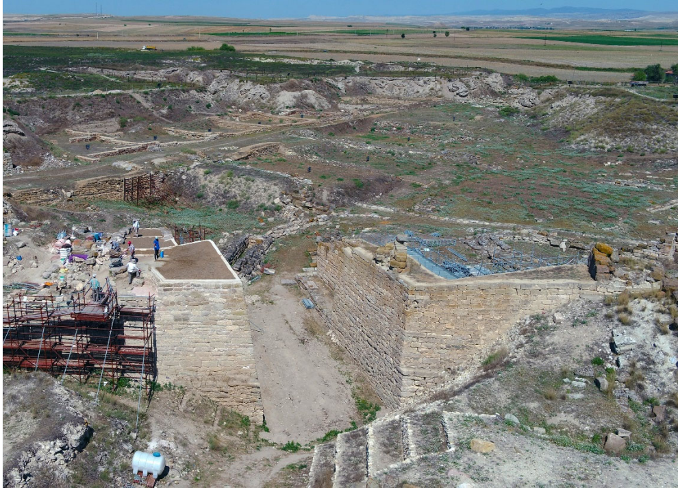
Early Phrygian East Gate of Gordion.