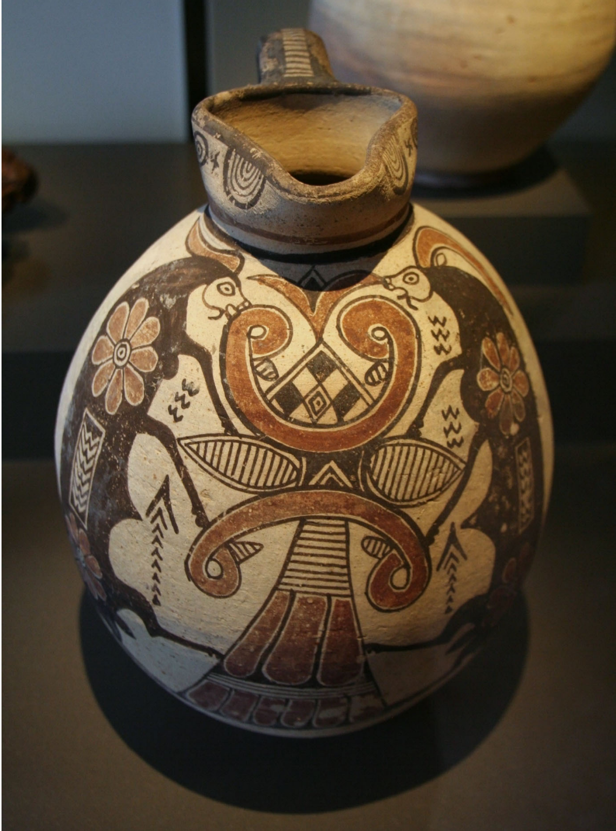
Jug with Scenic Decoration, Cyprus, 800–600 BC, Neues Museum, Berlin.