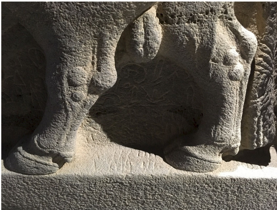
Late Hittite style statue representing the Storm-god Tarhunza standing upright on a cart pulled by two bulls. The base holds a bilingual Phoenician and Hieroglyphic Luwian inscription by Awariku of Hiyawa/Quwe.