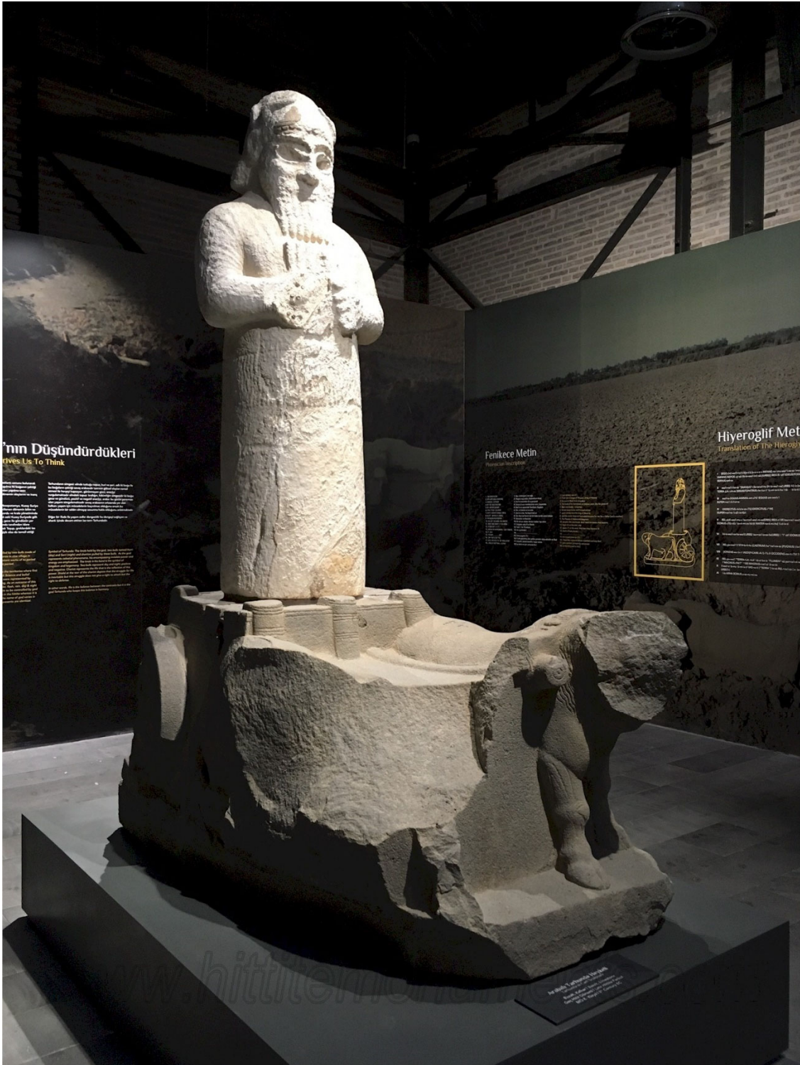
Late Hittite style statue representing the Storm-god Tarhunza standing upright on a cart pulled by two bulls. The base holds a bilingual Phoenician and Hieroglyphic Luwian inscription by Awariku of Hiyawa/Quwe.