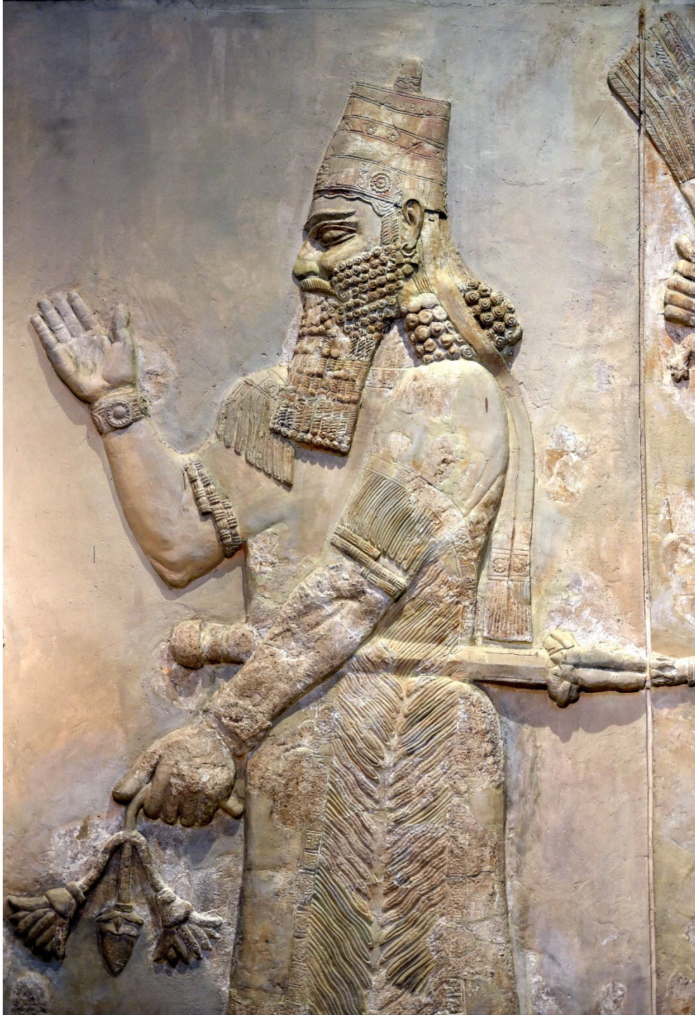
Alabaster bas-relief from the royal palace of Sargon II at Khorsabad, c. 722-705 BCE. Part of a long tributary scene depicting tribute bearers from Urartu. The Iraq Museum, Baghdad. This sculpture was made circa 700 BCE and is therefore free of author rights. But this photograph of the sculpture is a modern creative work and is fully copyrighted under the Creative Commons License below.