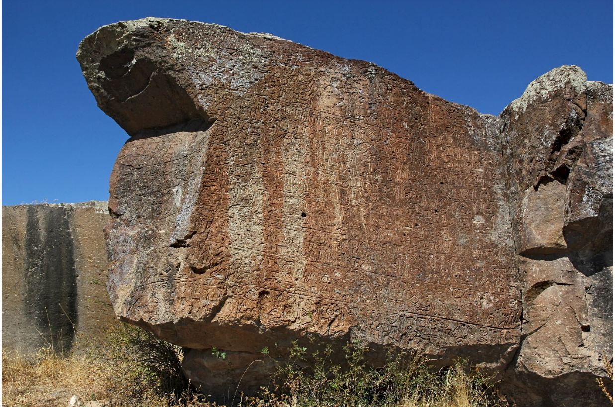
Inscription of Wasusarma, "Great King" of Tabal. 8 th century BC. By Ingeborg Simon - Own work, CC BY-SA 3.0, https://commons.wikimedia.org/w/index.php?curid=44116564 .