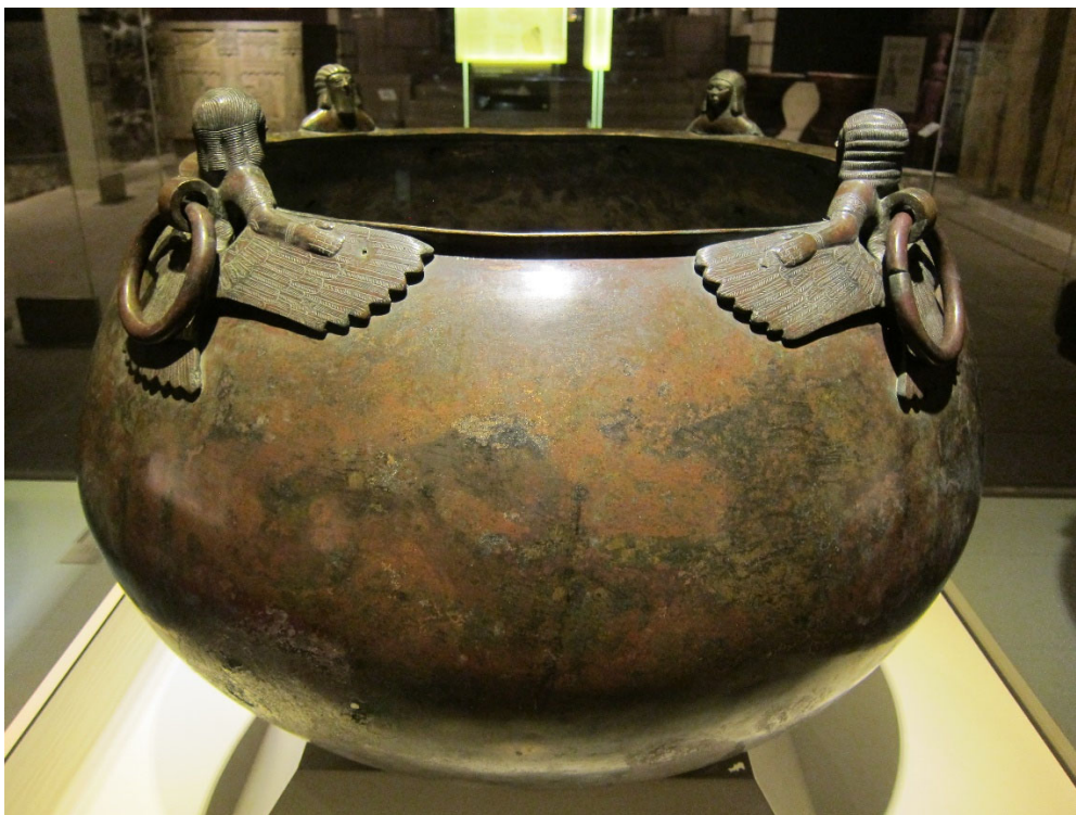
Phrygian bronze cauldron recovered from the city of Gordion, 8 th century BC, Museum of Anatolian Civilization, Ankara, Turkiye.