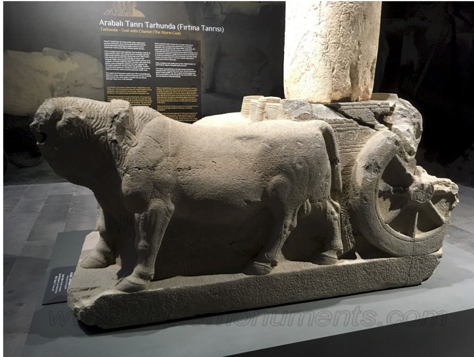
Late Hittite style statue representing the Storm-god Tarhunza standing upright on a cart pulled by two bulls. The base holds a bilingual Phoenician and Hieroglyphic Luwian inscription by Awariku of Hiyawa/Quwe. Tayfun Bilgin, www.hittitemonuments.com/cinekoy/