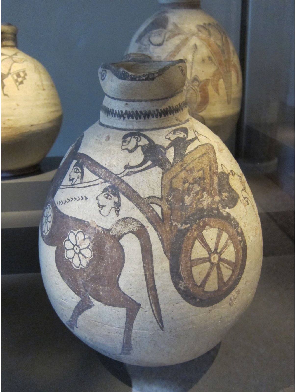
Jug with Scenic Decoration, Cyprus, 800–600 BC, Neues Museum, Berlin.