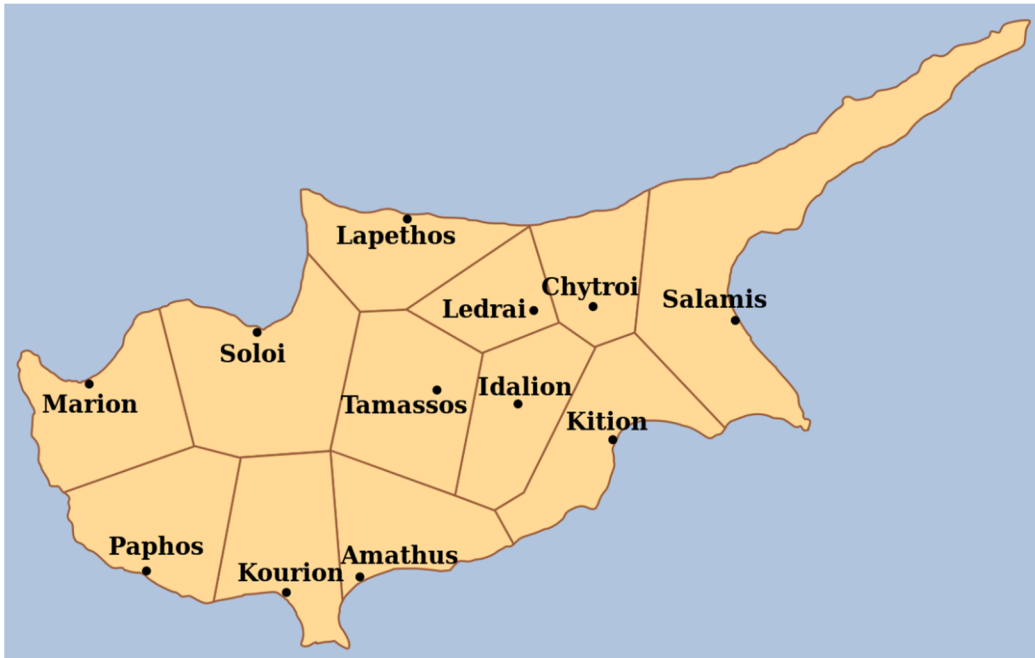
Map of the ancient kingdoms of Cyprus. By Badseed, using work by User:Evil berry and User:Zamonin - Own work, using Chypriotische koninkrijken.PNG by User:Evil berry, which in turn was based on Cyprus topo.png by User:Zamonin, and using my own Cyprus blank 1.svg as base., CC BY-SA 3.0, https://commons.wikimedia.org/w/index.php?curid=5577901