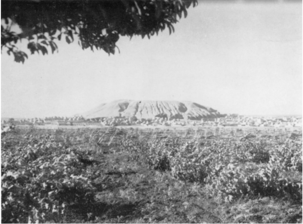
Photograph of Tell Rifa'at, Syria (ancient Arpad), excerpted from Reference [1]