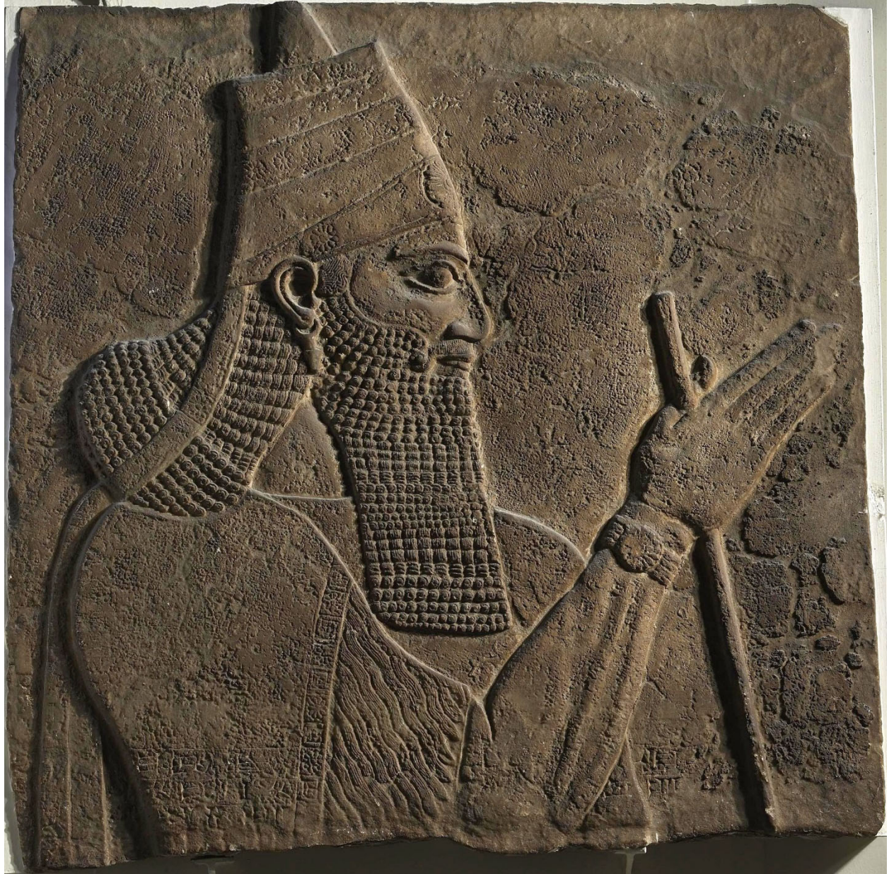
Gypsum wall panel relief: the king, Tiglath-Pileser III, wears a long full beard, a moustache, and carefully curled hair. His high crown is decorated with three bands which are ornamented with rosettes. The ornamented ends of the lowest band hang down his back. His garment has a fringed border decorated with rosettes alternating with concentric squares. His earring is of a common type; on his wrist he wears a four-fold bracelet with a many-petalled rosette in the middle. In his raised right hand he holds a staff; his left hand is no longer preserved. The panel contains an inscription. ( Description extracted from the British Museum ).