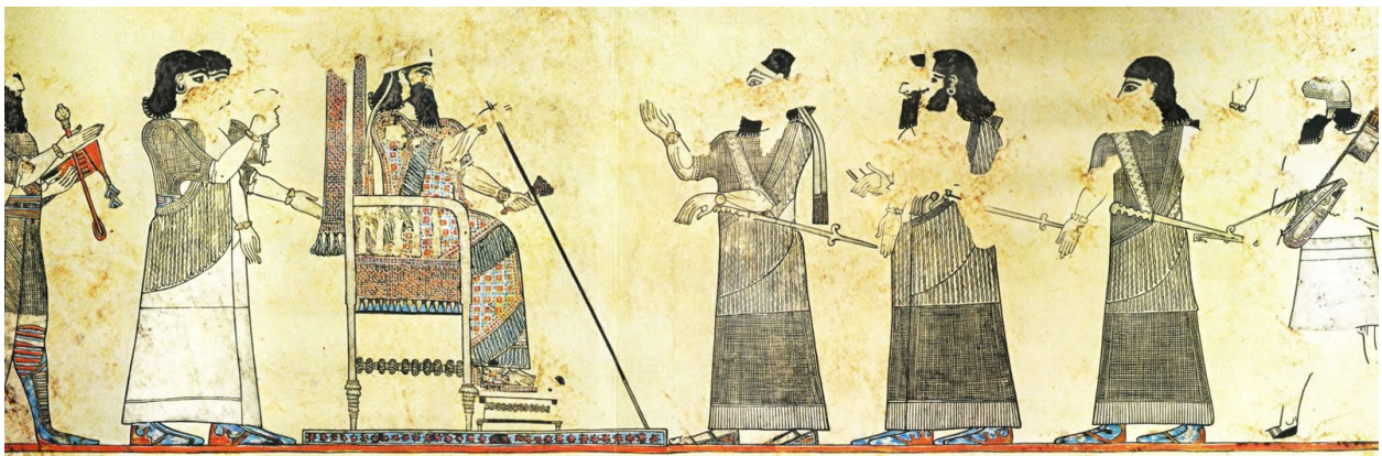
Wall painting from Til Barsip (Kar-Shalmaneser) depicting Tiglath-Pileser (sitting) holding court. The official closest to him to the right is his son Shalmaneser V.