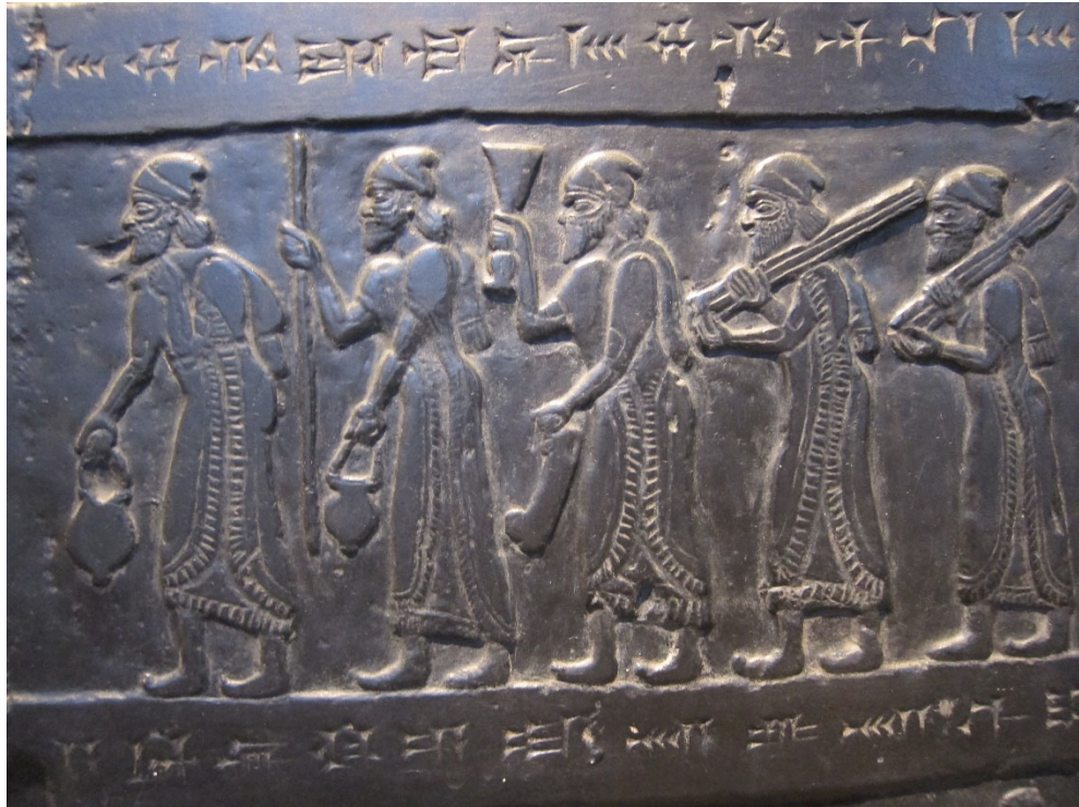
Detail from the second register of a reproduction of the Black Obelisk showing the tribute of Jehu of Israel. On display at the American Society for Overseas Research (ASOR), Chicago, Illinois.