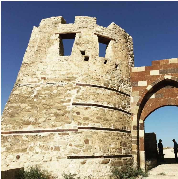
The Urartian capital of Tushpa/Van Kalesi, located at modern Van, Turkey