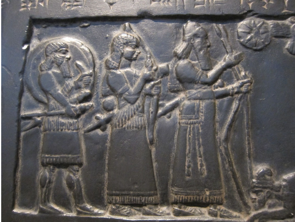
Detail from the top register of a reproduction of the Black Obelisk showing the tribute of Sua of Gilzanu. On display at the American Society for Overseas Research (ASOR), Chicago, Illinois.