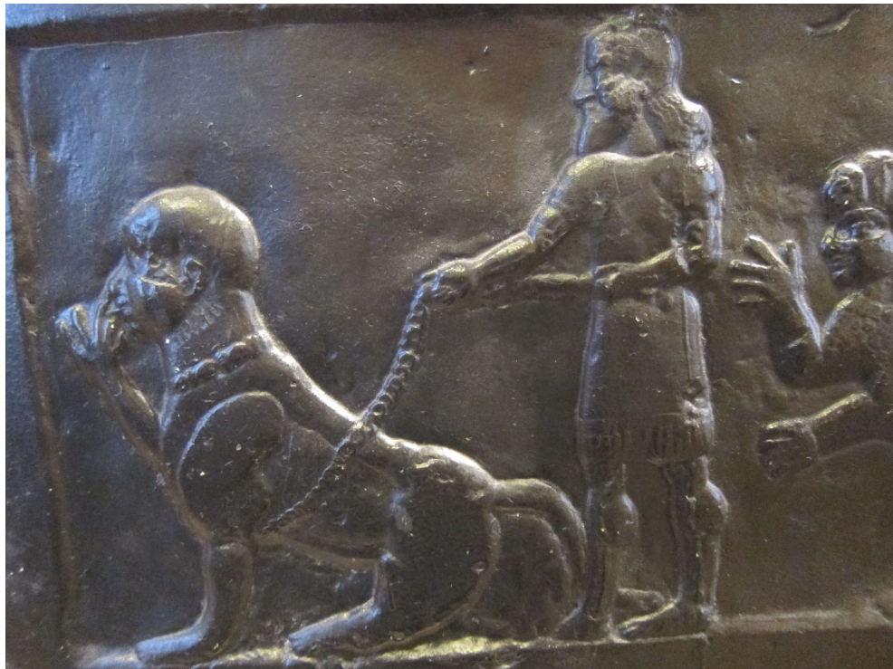
Detail from the third register of a reproduction of the Black Obelisk showing the tribute of Musri (Musasir?). On display at the American Society for Overseas Research (ASOR), Chicago, Illinois.