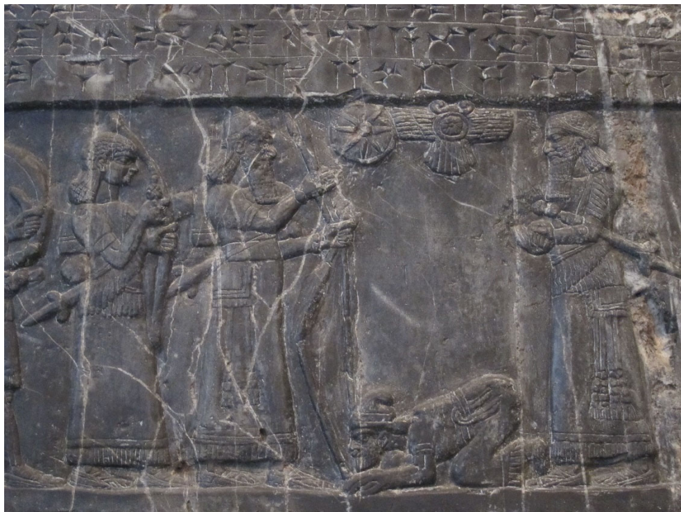
Detail from the second register of the ORIGINAL Black Obelisk showing the tribute of Jehu of Israel. On display at the British Museum.