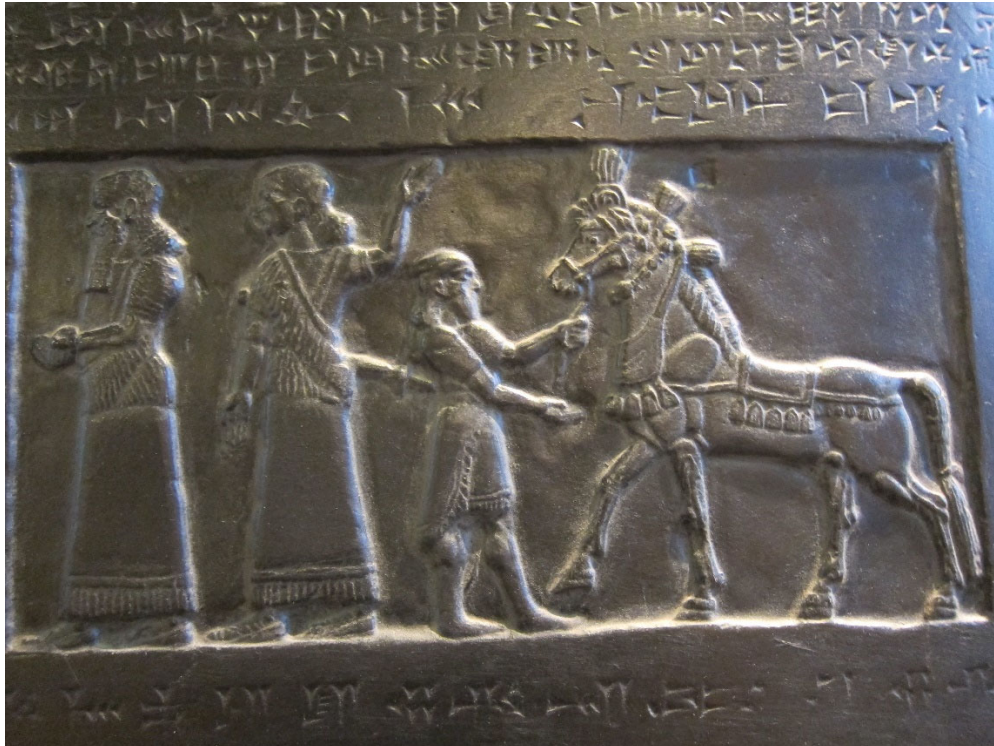
Detail from the second register of a reproduction of the Black Obelisk showing the tribute of Jehu of Israel. On display at the American Society for Overseas Research (ASOR), Chicago, Illinois.