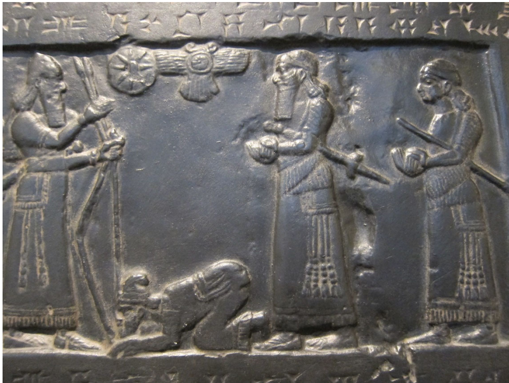
Detail from the top register of a reproduction of the Black Obelisk showing the tribute of Sua of Gilzanu. On display at the American Society for Overseas Research (ASOR), Chicago, Illinois.