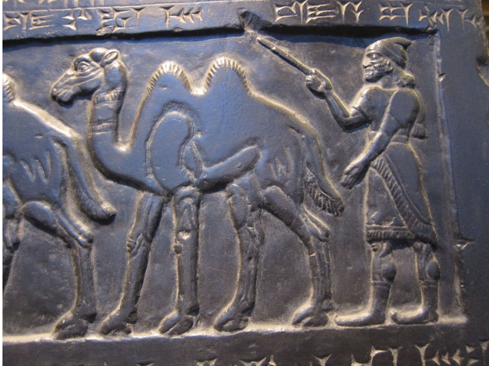
Detail from the top register of a reproduction of the Black Obelisk showing the tribute of Sua of Gilzanu. On display at the American Society for Overseas Research (ASOR), Chicago, Illinois.