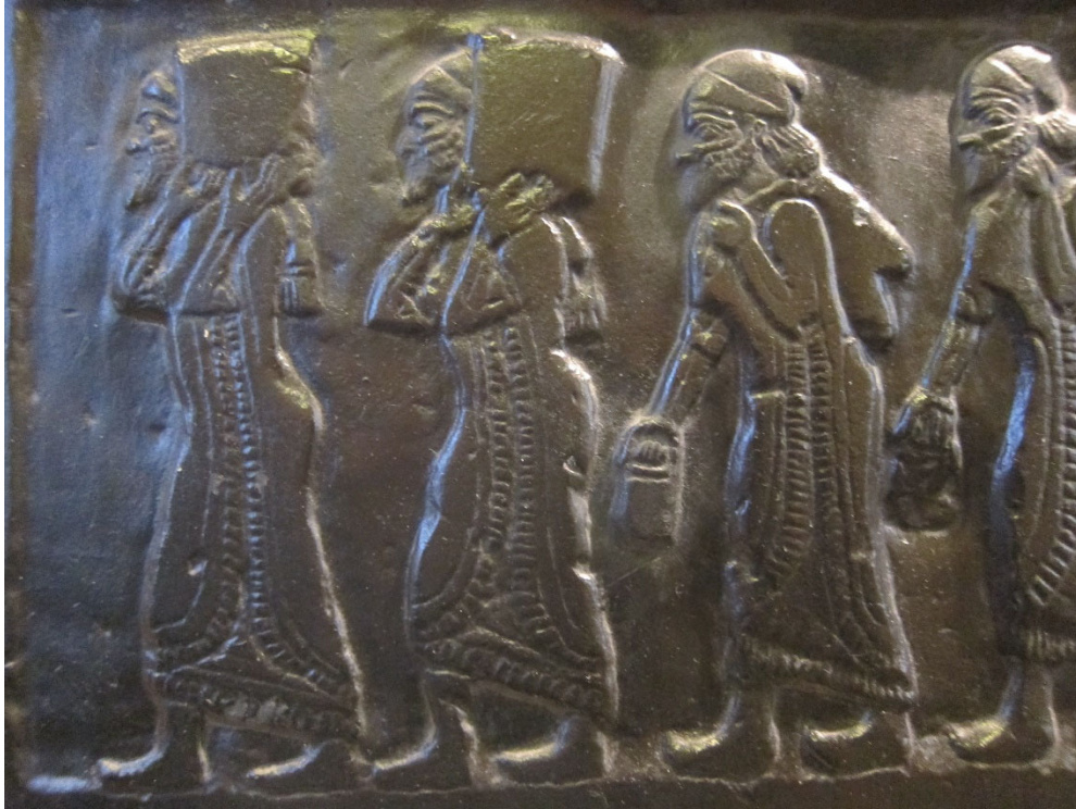
Detail from the second register of a reproduction of the Black Obelisk showing the tribute of Jehu of Israel. On display at the American Society for Overseas Research (ASOR), Chicago, Illinois.