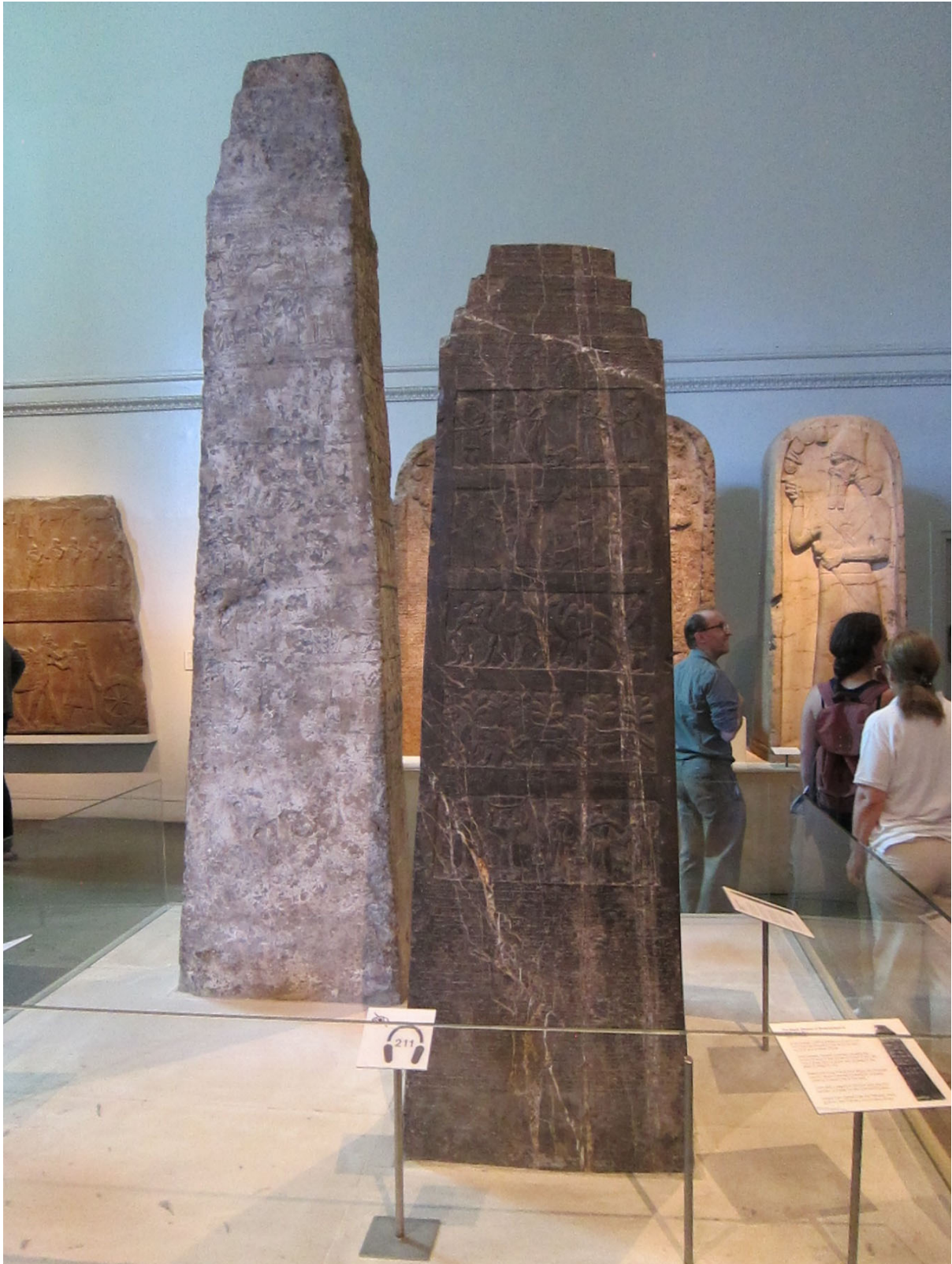
The (original) Black Obelisk of Shalmaneser III (or Black Obelisk of Assyria), on display at the British Museum, with the White Obelisk of Ashurnasirpal I behind it.