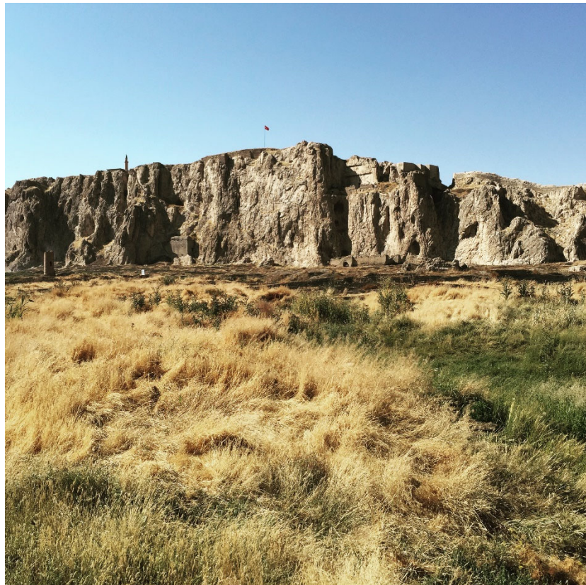
The Urtartian capital of Tushpa/Van Kalesi, located at modern Van, Turkey

Relief of the Temple of Haldi at Musasir, recovered from Sargon's palace at Dur-Sarrukin, reproduced from Botta, 1849 (excepted from Reference [7]).