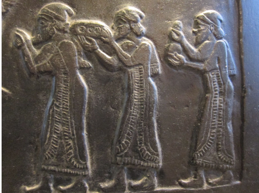
Detail from the second register of a reproduction of the Black Obelisk showing the tribute of Jehu of Israel. On display at the American Society for Overseas Research (ASOR), Chicago, Illinois.