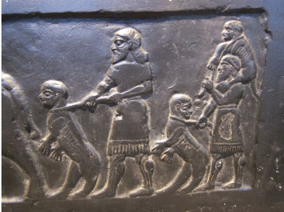
Detail from the third register of a reproduction of the Black Obelisk showing the tribute of Musri (Musasir?). On display at the American Society for Overseas Research (ASOR), Chicago, Illinois.