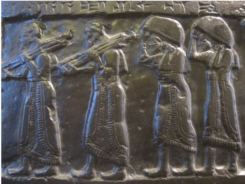
Detail from the top register of a reproduction of the Black Obelisk showing the tribute of Sua of Gilzanu. On display at the American Society for Overseas Research (ASOR), Chicago, Illinois.