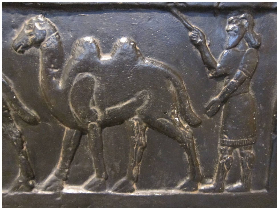
Detail from the third register of a reproduction of the Black Obelisk showing the tribute of Musri (Musasir?). On display at the American Society for Overseas Research (ASOR), Chicago, Illinois.