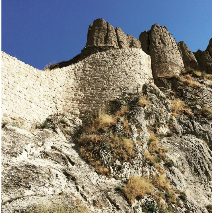
The Urartian capital of Tushpa/Van Kalesi, located at modern Van, Turkey