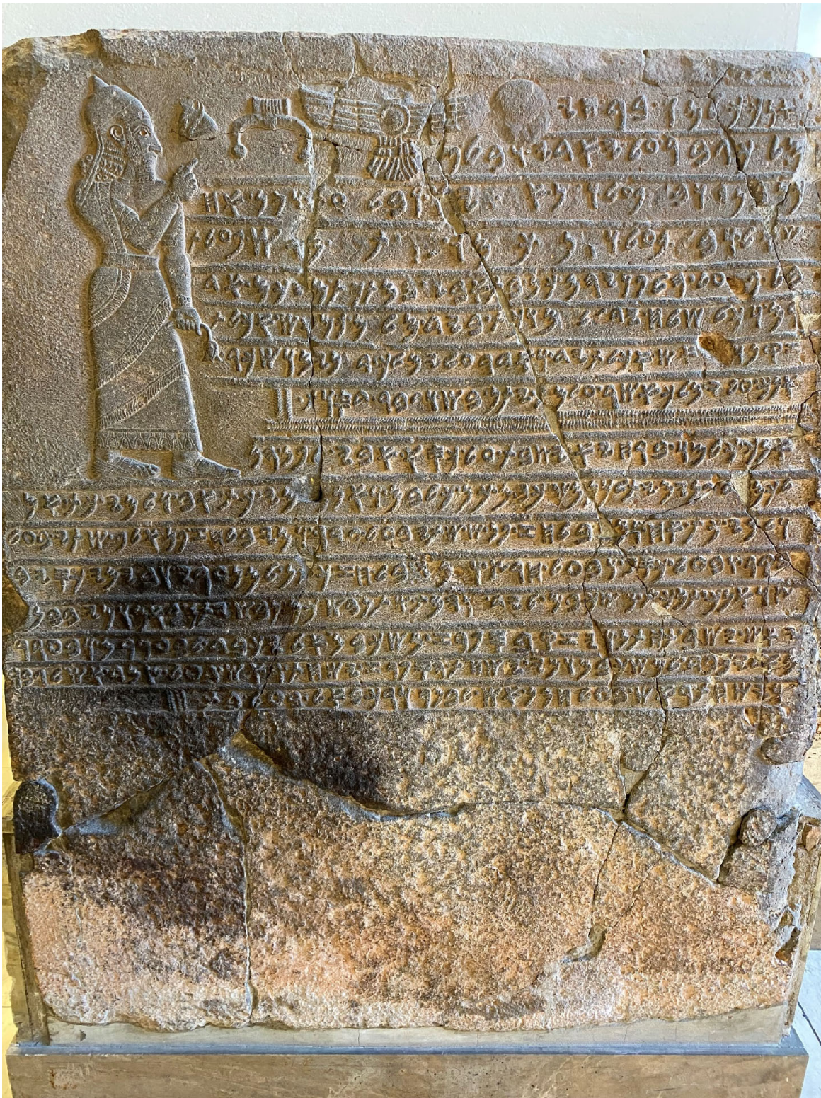
Stele of King Kilamuwa of Sam'al, c. 830 BC, on display at the Pergamon Museum, Berlin, Germany.