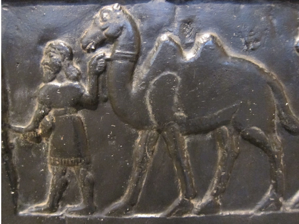
Detail from the third register of a reproduction of the Black Obelisk showing the tribute of Musri (Musasir?). On display at the American Society for Overseas Research (ASOR), Chicago, Illinois.