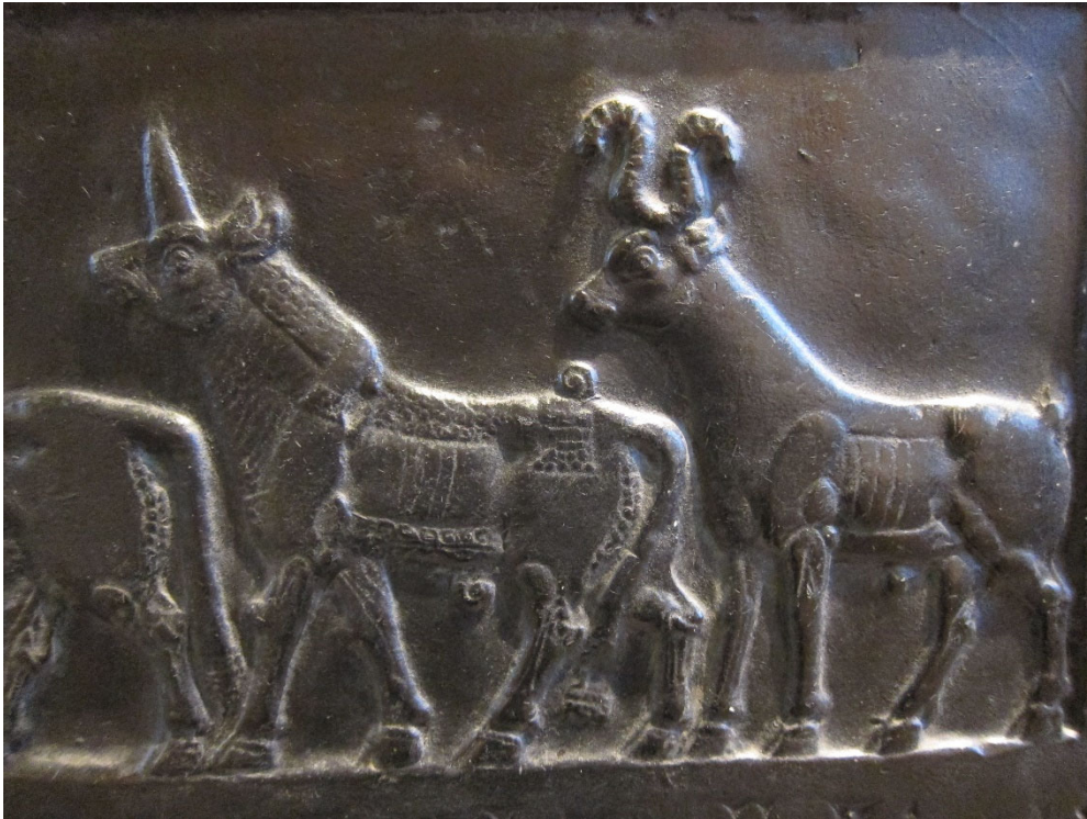
Detail from the third register of a reproduction of the Black Obelisk showing the tribute of Musri (Musasir?). On display at the American Society for Overseas Research (ASOR), Chicago, Illinois.