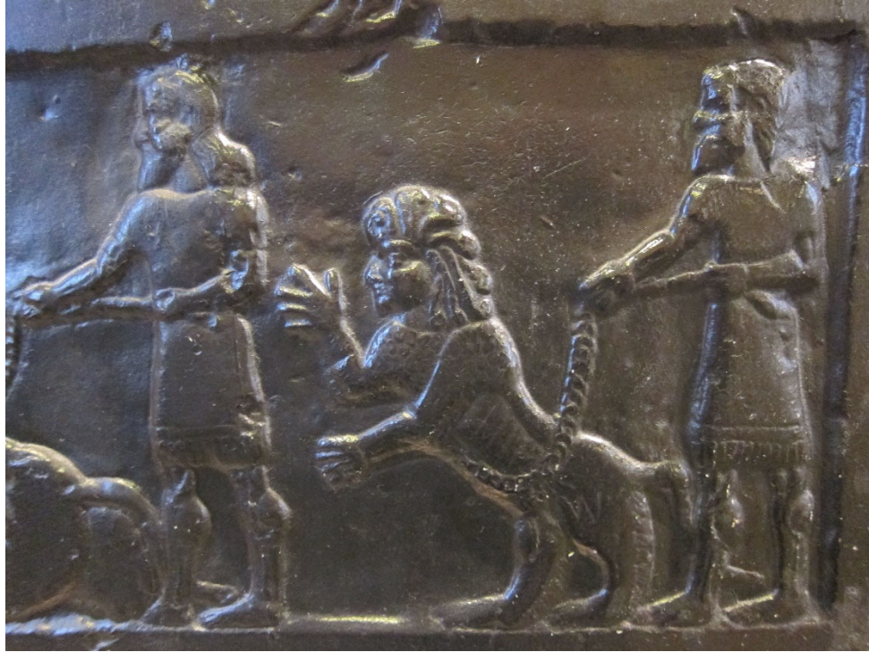
Detail from the third register of a reproduction of the Black Obelisk showing the tribute of Musri (Musasir?). On display at the American Society for Overseas Research (ASOR), Chicago, Illinois.