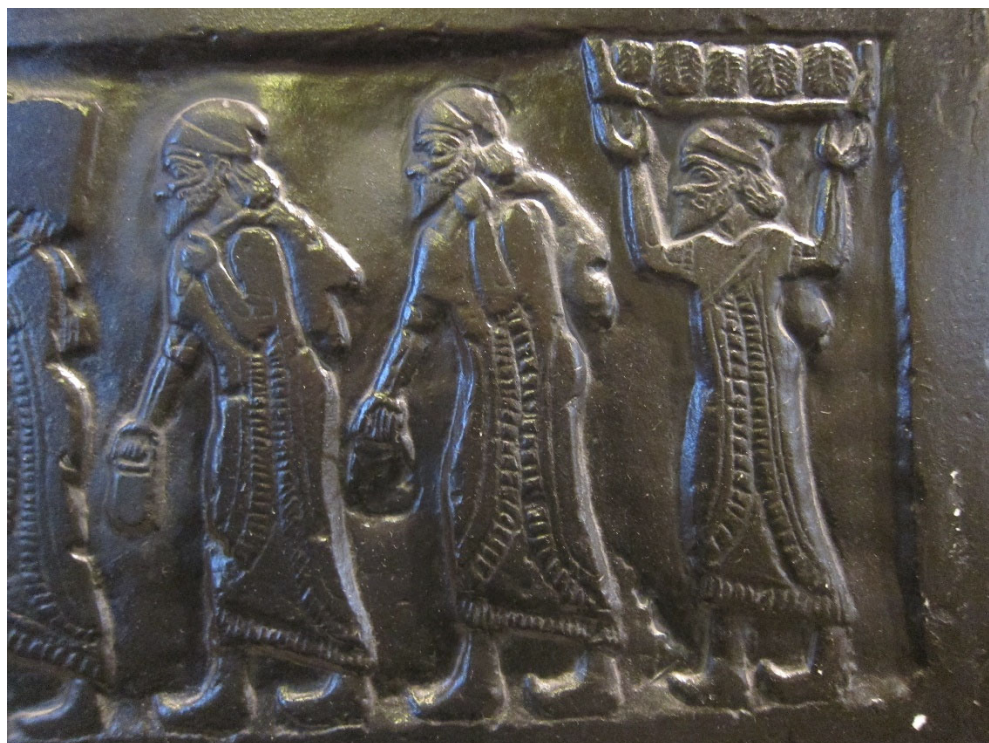
Detail from the second register of a reproduction of the Black Obelisk showing the tribute of Jehu of Israel. On display at the American Society for Overseas Research (ASOR), Chicago, Illinois.