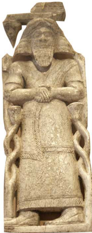
Aramaean king Hazael, from Arslan Tash. http://www.biblearchaeology.org/post/2011/05/04/The-Tel-Dan-Stela-and-the-Kings-of-Aram-and-Israel.aspx .