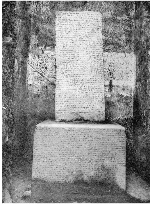
Annals of King Sarduri I of Urartu (1915).