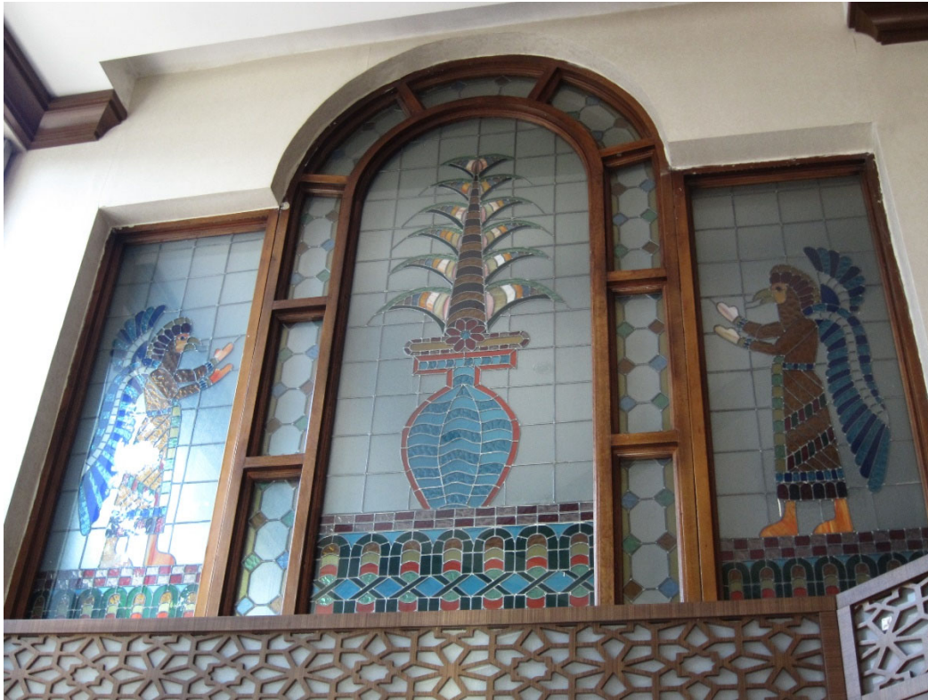
The Urartu Hotel in Van, Turkey (2015)