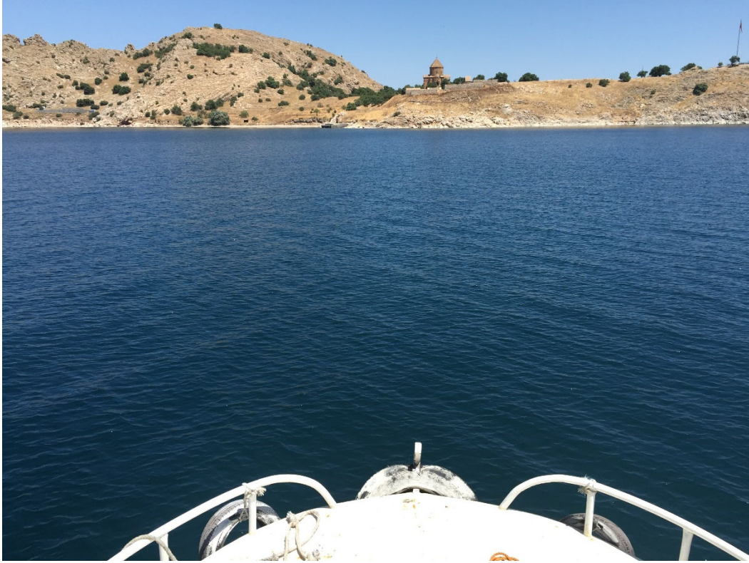
Lake Van, Turkey (2015)