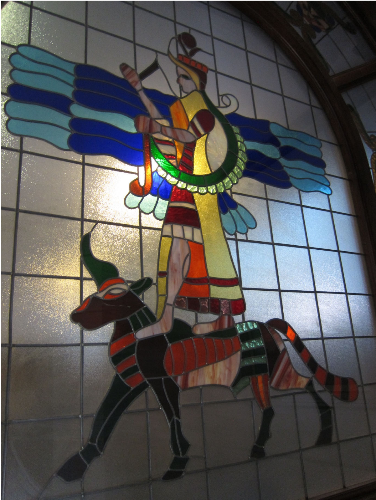
The Urartu Hotel in Van, Turkey (2015)