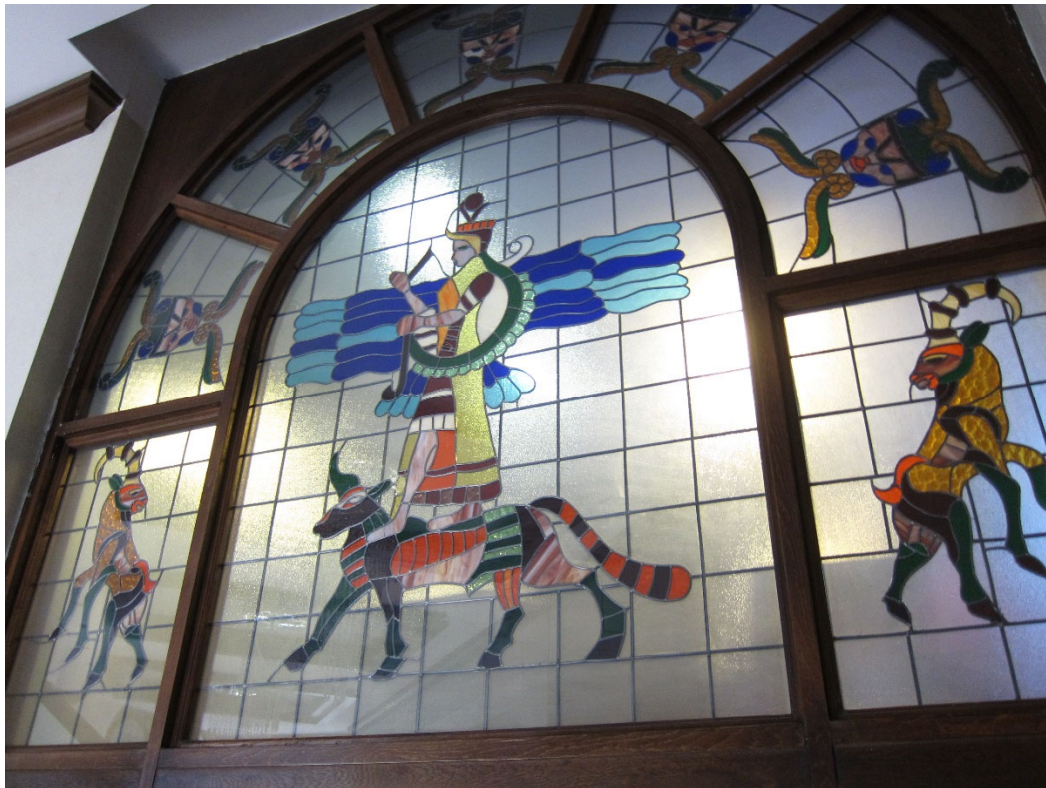
The Urartu Hotel in Van, Turkey (2015)