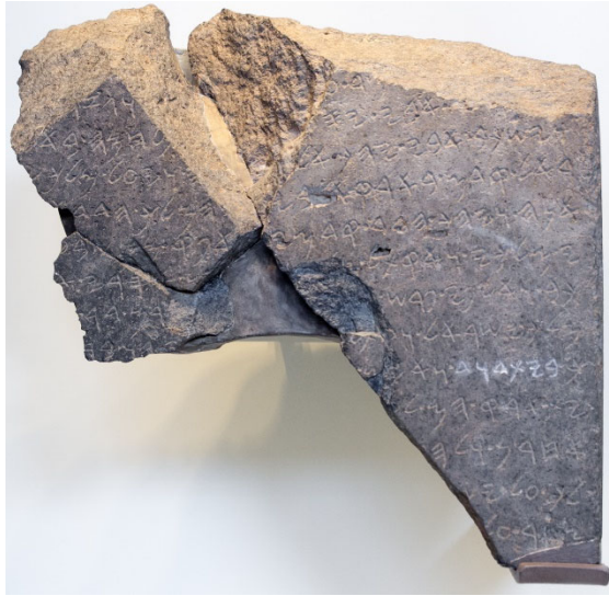
The Tel Dan Stele on display at the Israel Museum, Jerusalem.