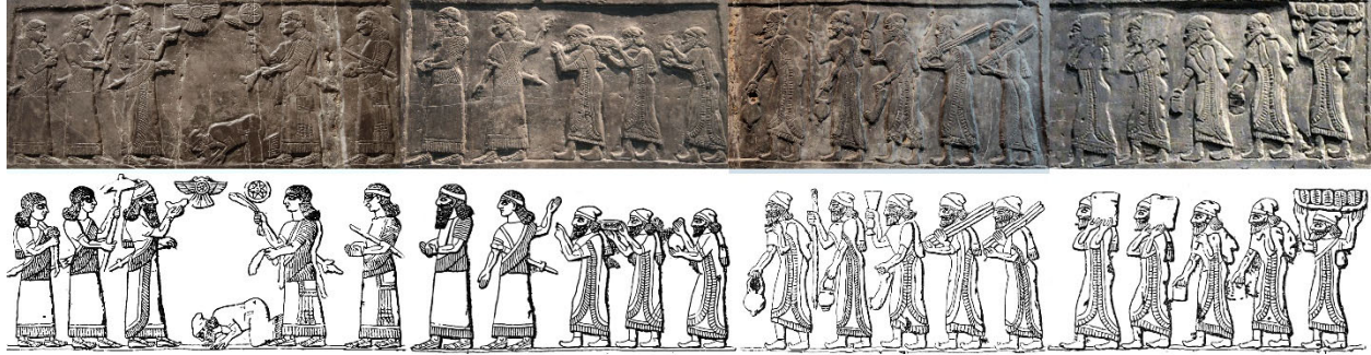
Black Obelisk, Jehu's delegation to Shalmaneser III.