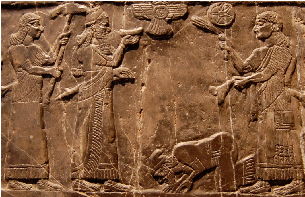
Depiction of Jehu King of Israel giving tribute to King Shalmaneser III of Assyria, on the Black Obelisk of Shalmaneser III from Nimrud (circa 827 BC) in the British Museum (London). By Steven G. Johnson (Own work), CC BY-SA 3.0, https://commons.wikimedia.org/w/index.php?curid=11326786 .