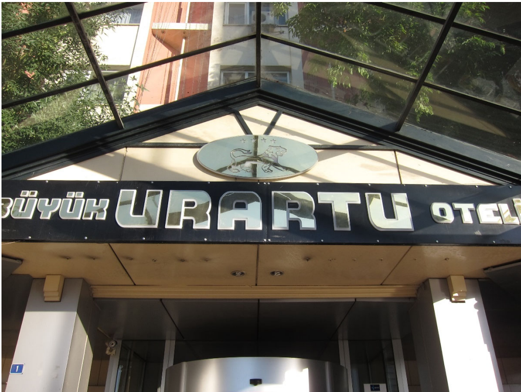
The Urartu Hotel in Van, Turkey (2015)