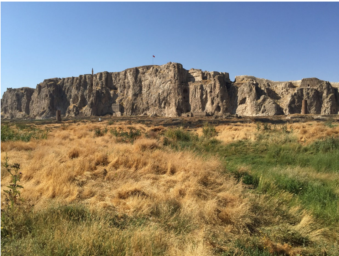
Van Fortress, Turkey (2015)