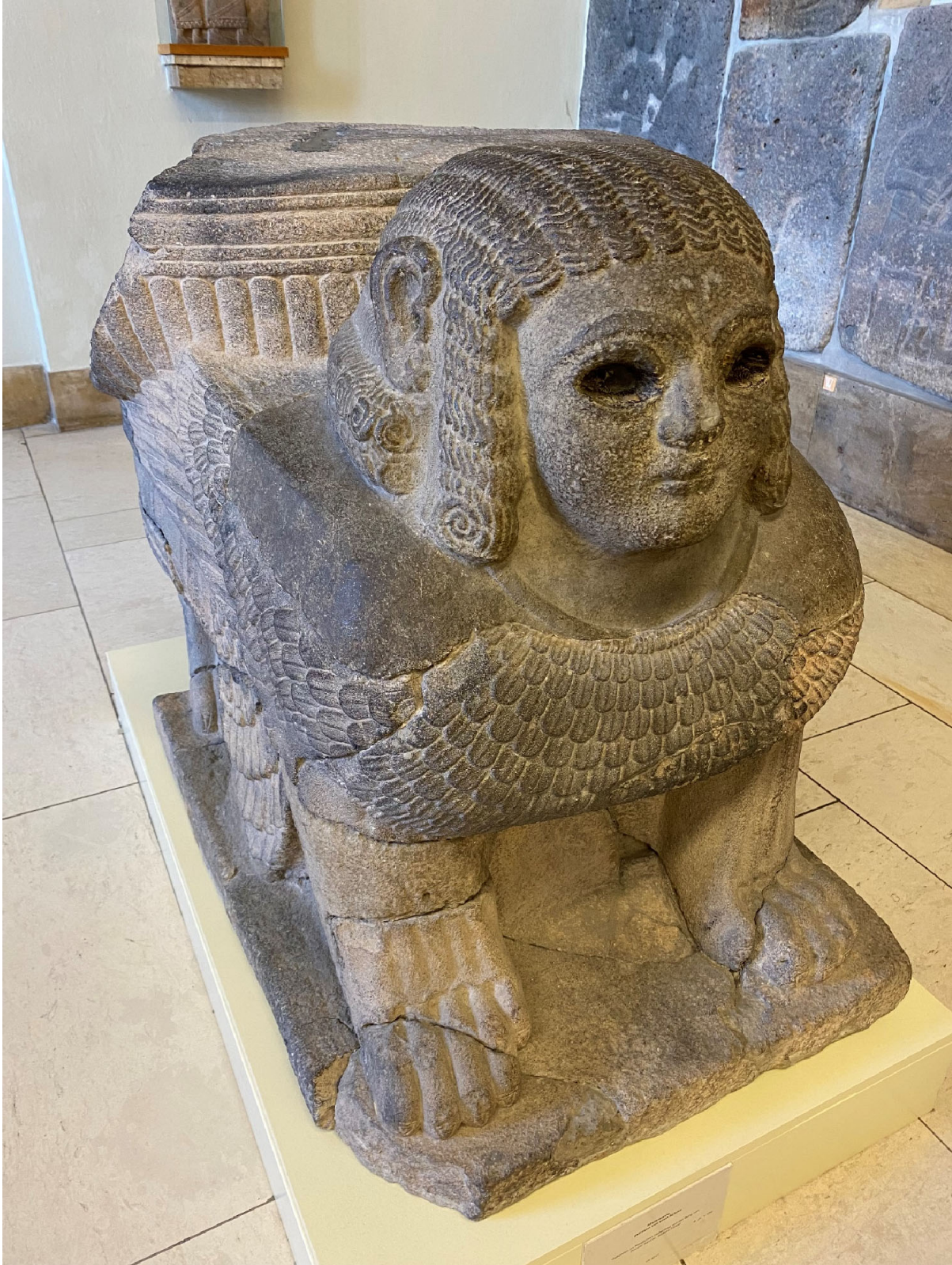
Sphinx from Sam'al/Zincirli, Turkey, 8 th cent. BC, on display at the Pergamon Museum, Berlin