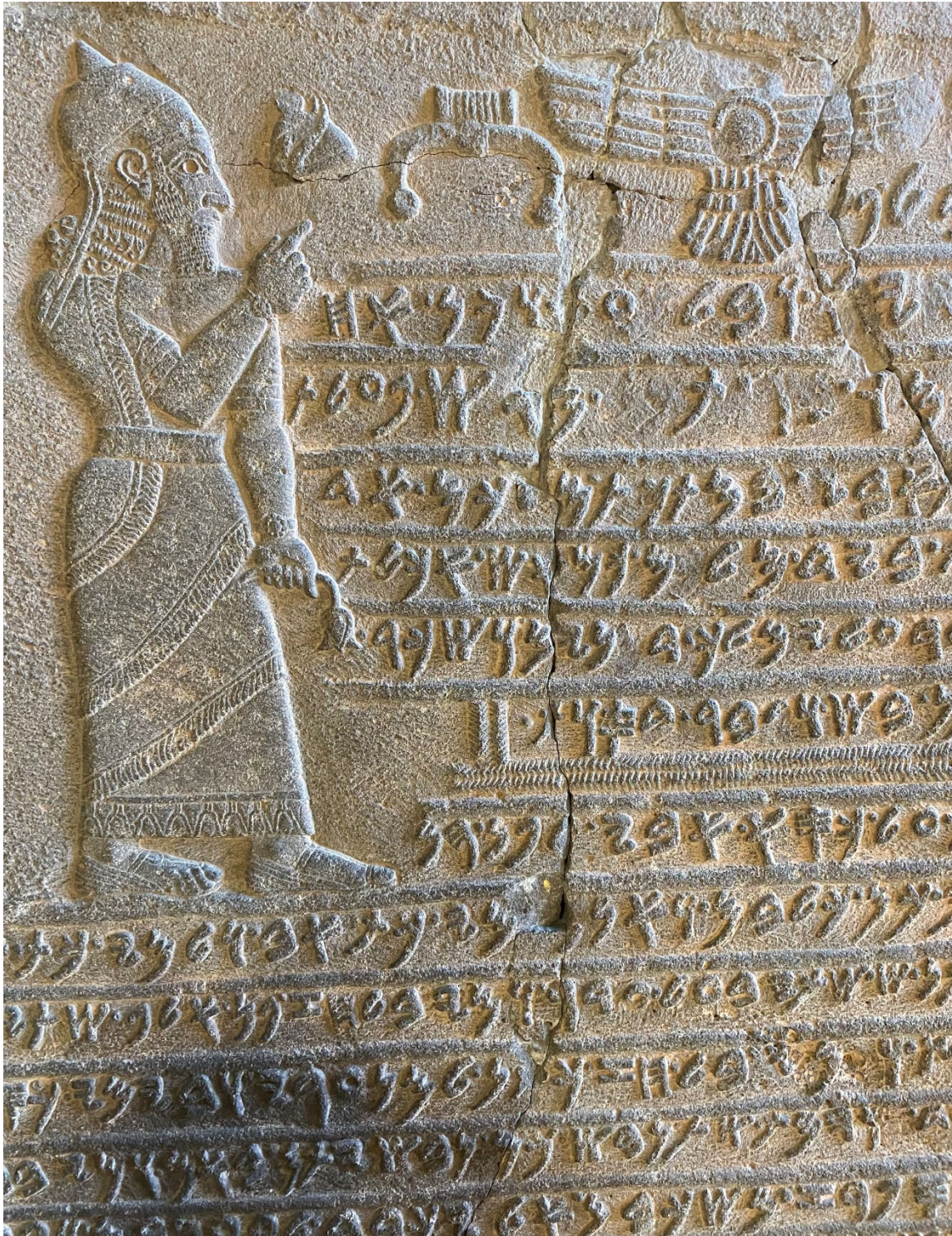
Basalt stele of King Kilamuwa of Sam'al, c. 825 BC. The accompanying text in the Phoenician script reads (in part): "The house of my father was in the midst of mighty kings. Each one stretched forth his hand to fight." On display at the Pergamon Museum, Berlin