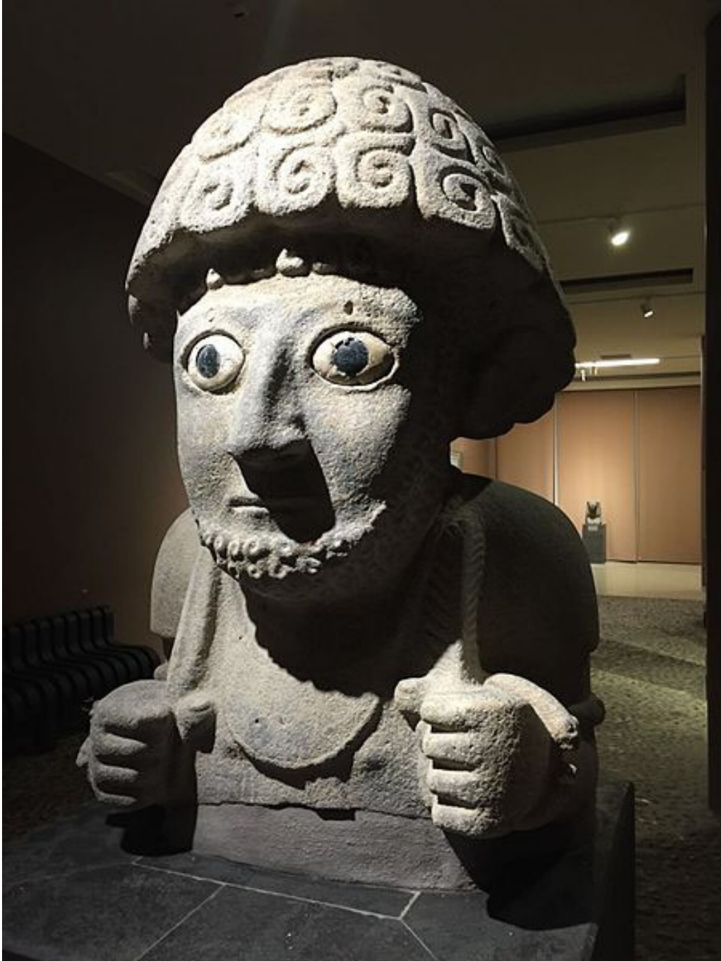
Bust of King Suppiluliuma II of Patin, on display at the Archaeological Museum of Antakya, Turkey