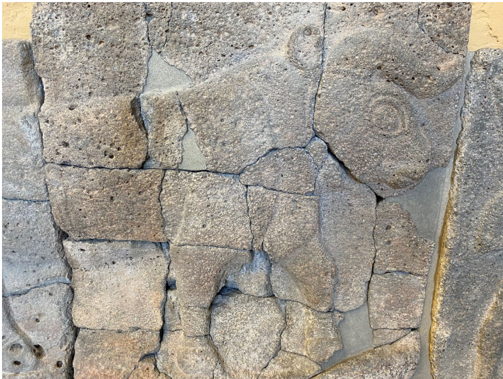
Bull relief from Sam'al/Zincirli, Turkey, on display at the Pergamon Museum, Berlin