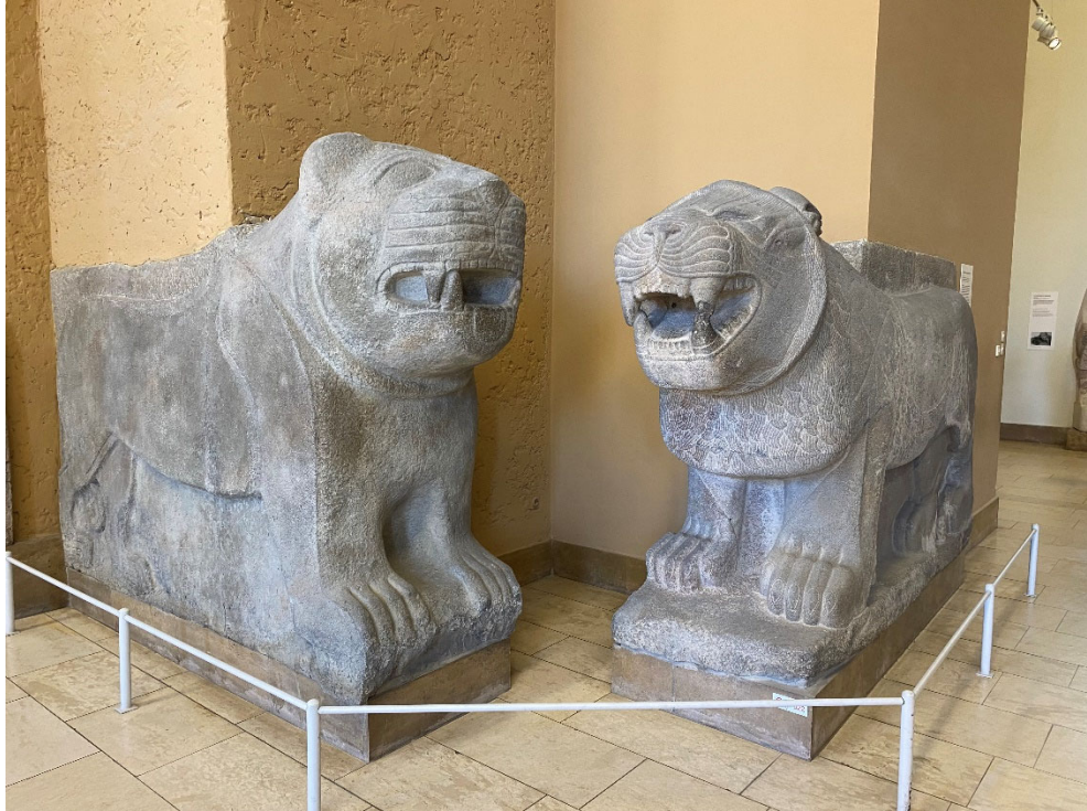
Gate lions from Sam'al/Zincirli, 10 th and 8 th cent. BC, on display at the Pergamon Museum, Berlin