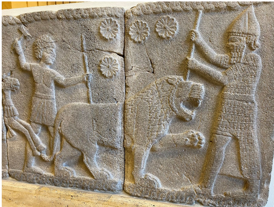
Relief from the royal palace of the frontier city of Litibu in the kingdom of Sam'al, 8 th century BC, showing two divine figures attacking a lion. On display at the Pergamon Museum, Berlin