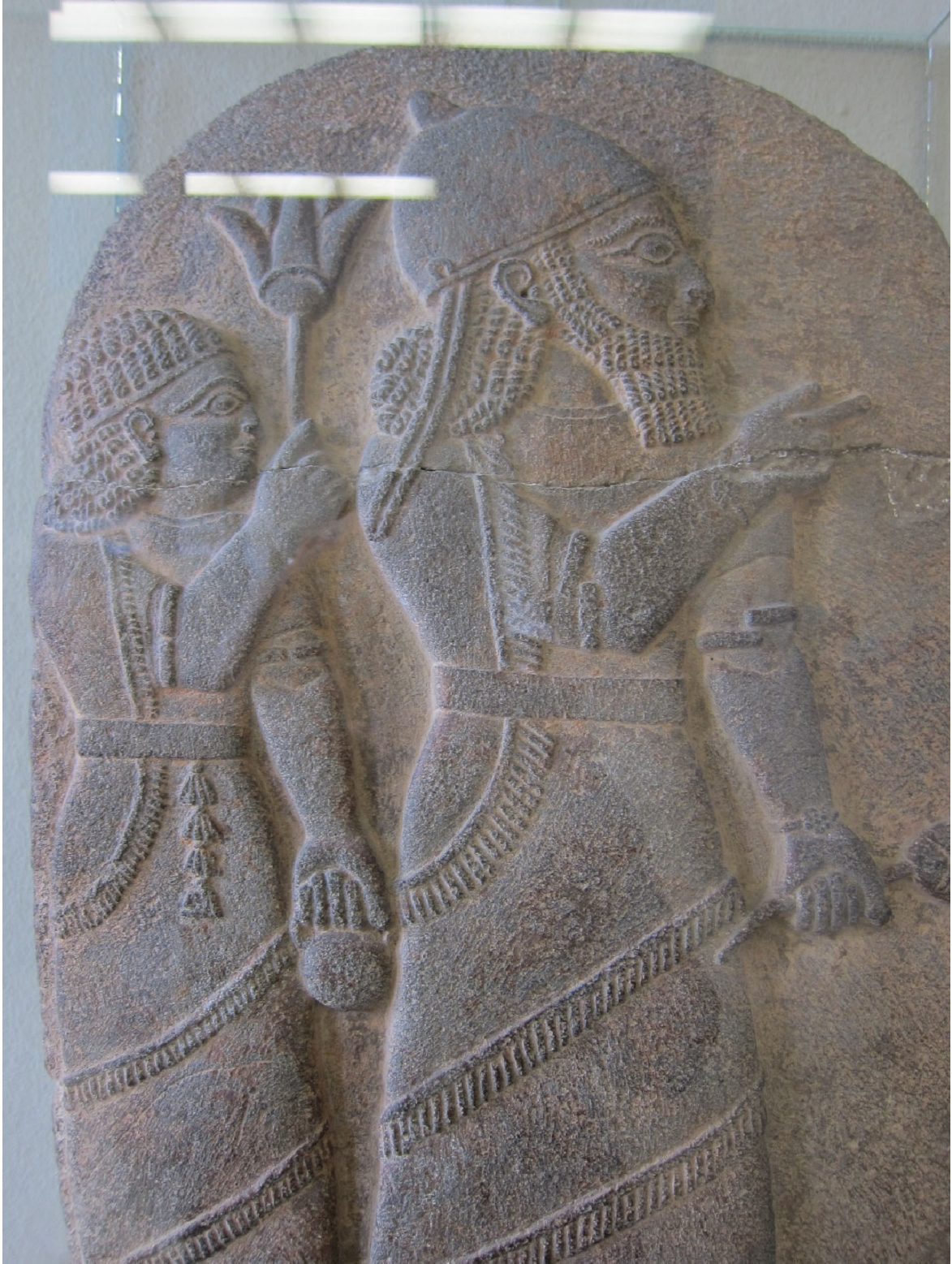
Basalt stela showing King Kilamuwa of Sam'al accompanied by his servant, c. 830 BC, on display at the Pergamon Museum, Berlin