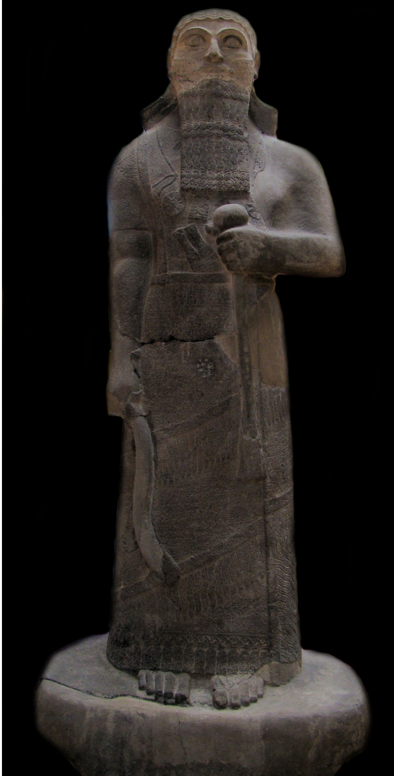
Statue of Shalmaneser III at Istanbul Archaeological Museums. By Bjørn Christian Tørrissen - Own work by uploader, http://bjornfree.com/galleries.html , CC BY-SA 3.0, https://commons.wikimedia.org/w/index.php?curid=8327849