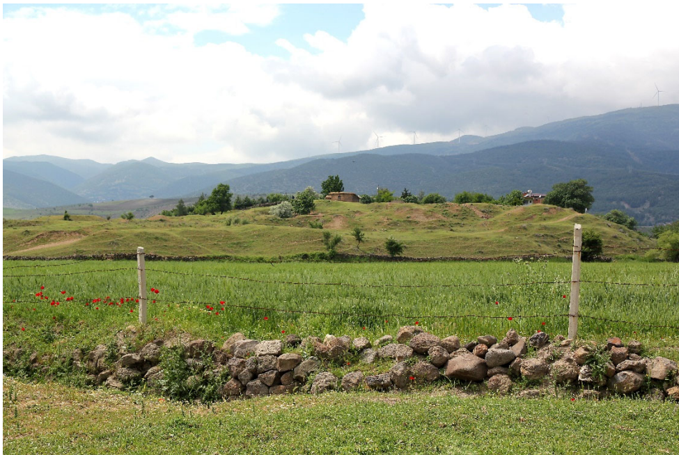
Modern photo of the archaeological site of Sam'al/Zincirli, Turkey.