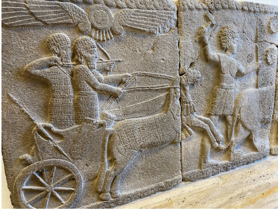
Relief from the royal palace of the frontier city of Litibu in the kingdom of Sam'al, 8 th century BC, showing a king and his companion, wearing scale-armor, driving a chariot with armored horses beneath a winged sun-disk. On display at the Pergamon Museum, Berlin