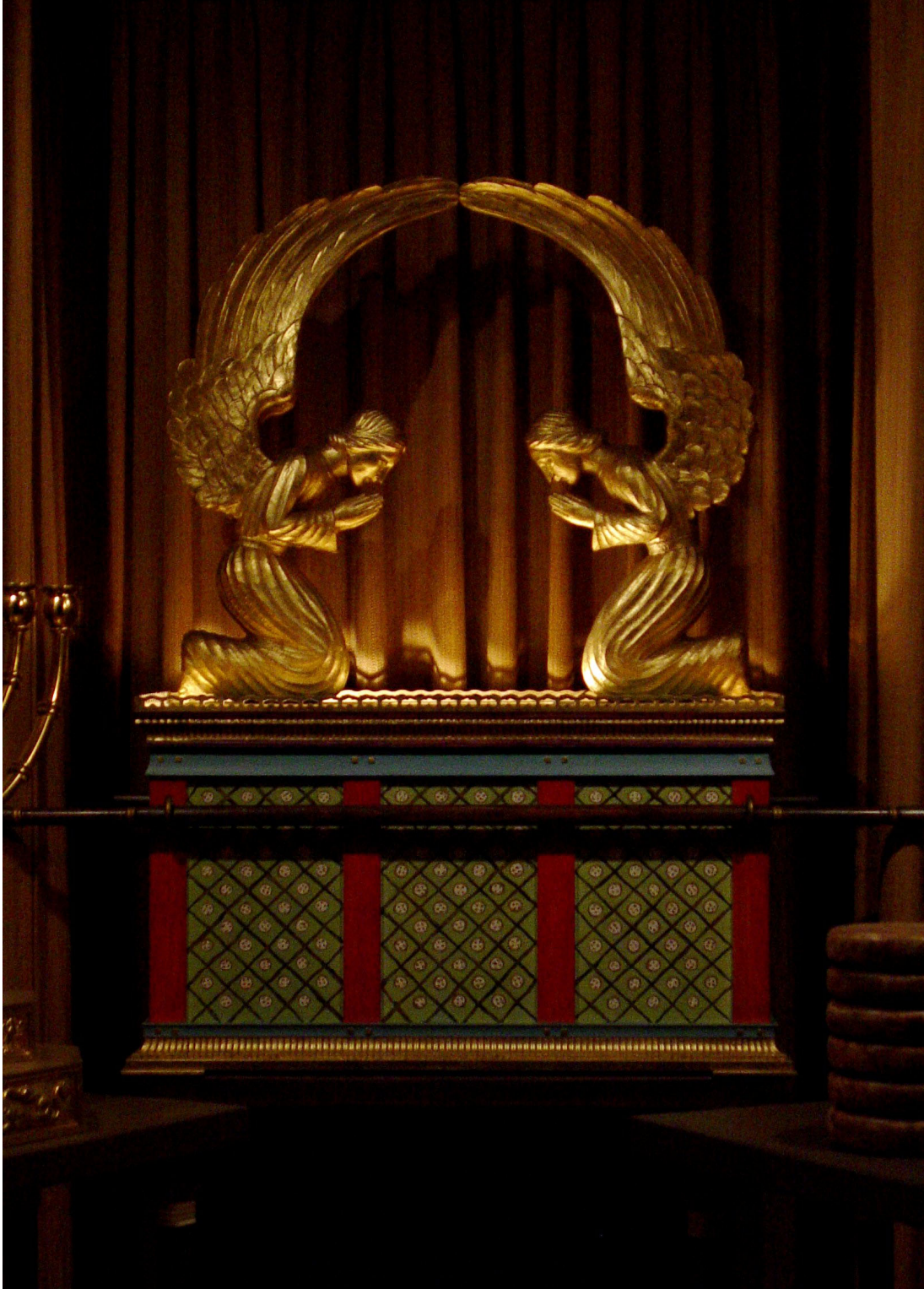
Replica of the Ark of the Covenant in George Washington Masonic National Memorial