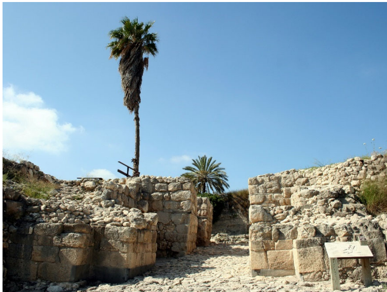
Late Bronze Age Gate of Megiddo