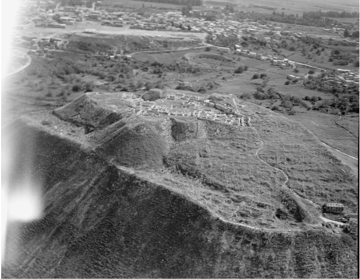
Archaeological excavation at Tell Beth-Shean in 1937