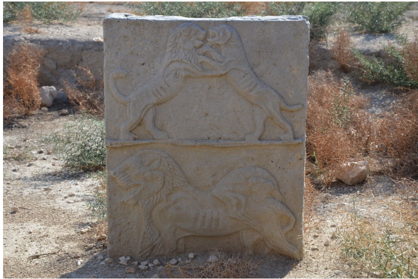
Lion and Lioness relief from the Egyptian governor's house at Beth-Shean

By Carole Raddato from Frankfurt, Germany - The Egyptian governor's house, 12th century BC, Scythopolis (Beit She'an), Israel, CC BY-SA 2.0, https://commons.wikimedia.org/w/index.php?curid=47920646