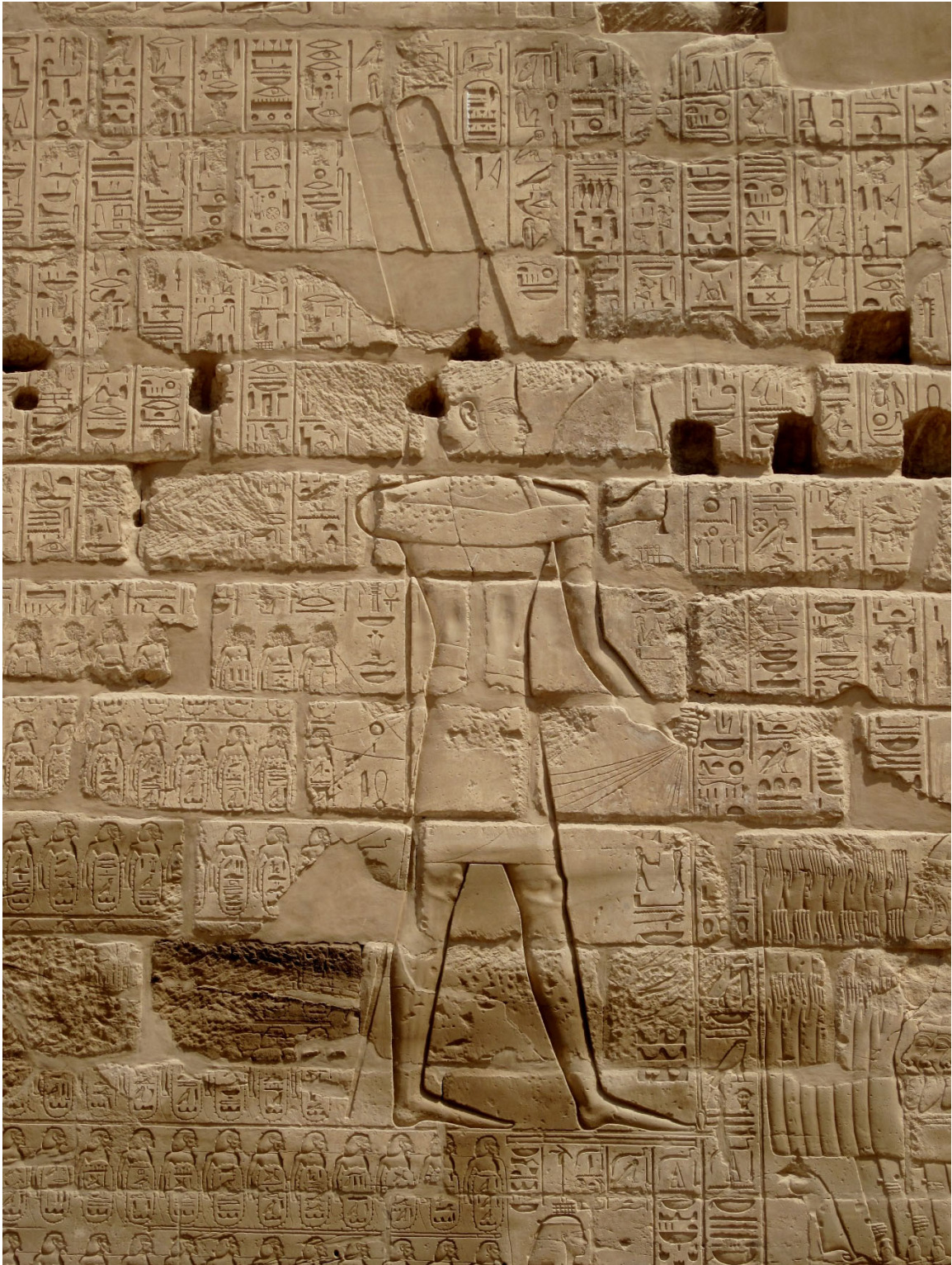
The Triumphal Relief of Shoshenq I near the Bubastite Portal at Karnak, depicting the god Amun-Re receiving a list of cities and villages conquered by the king in his Near Eastern military campaigns