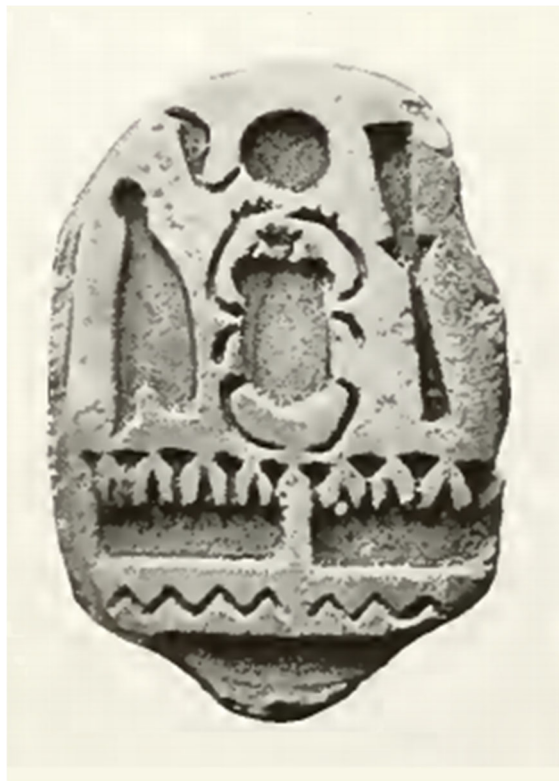
Picture of a scarab of Hedjkheperre Shoshenq I by Flinders Petrie

The Egyptian governor's house, 12th century BC, Scythopolis (Beit She'an), Israel, CC BY-SA 2.0, https://commons.wikimedia.org/w/index.php?curid=47920646