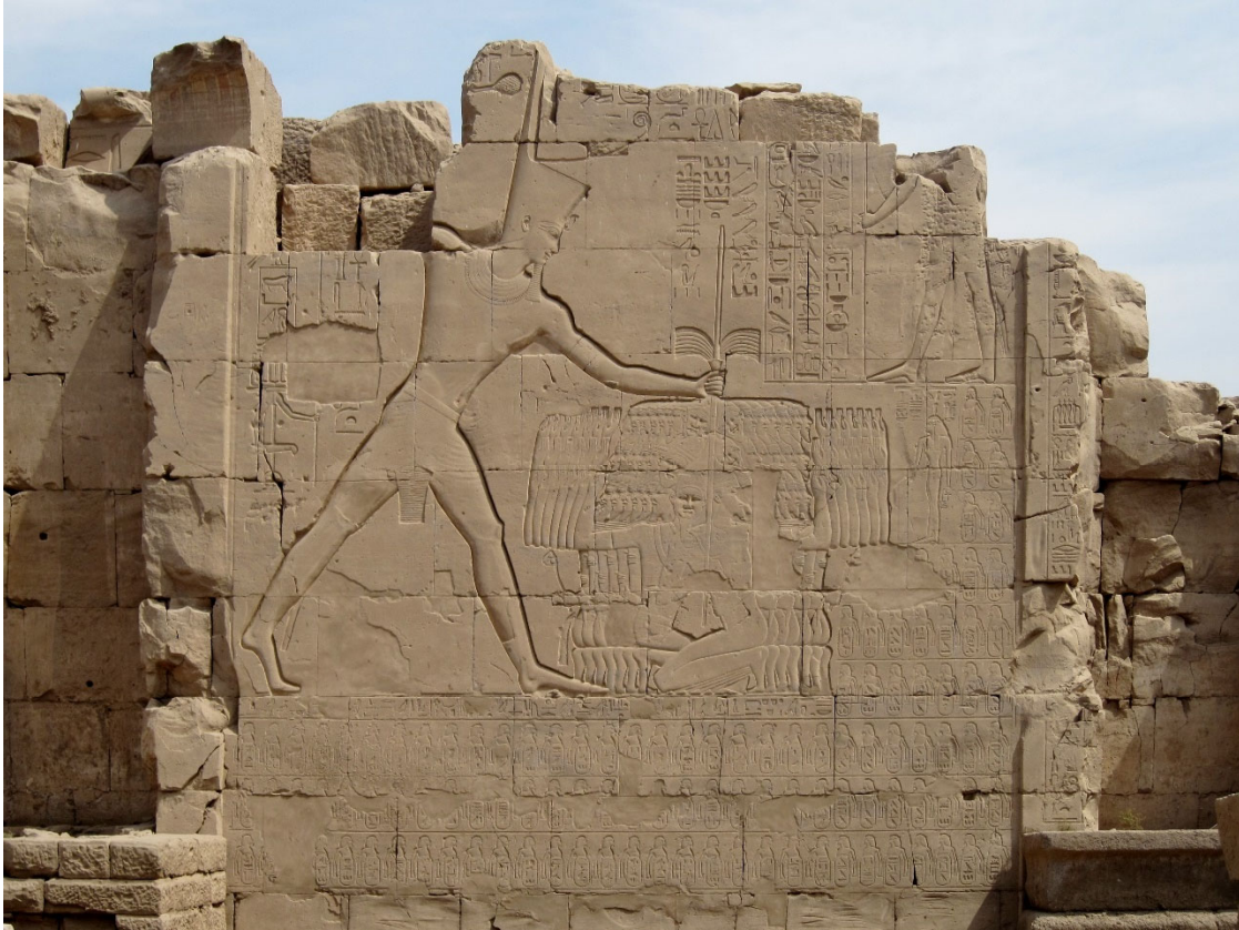
Relief in the Karnak Temple showing Thutmose II slaying Canaanite captives from the Battle of Megiddo

15th century BC, By Olaf Tausch - Own work, CC BY 3.0, https://commons.wikimedia.org/w/index.php?curid=9870462